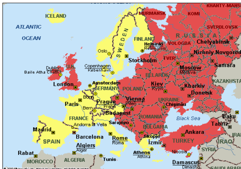
Map 1: Schengen states in 2006