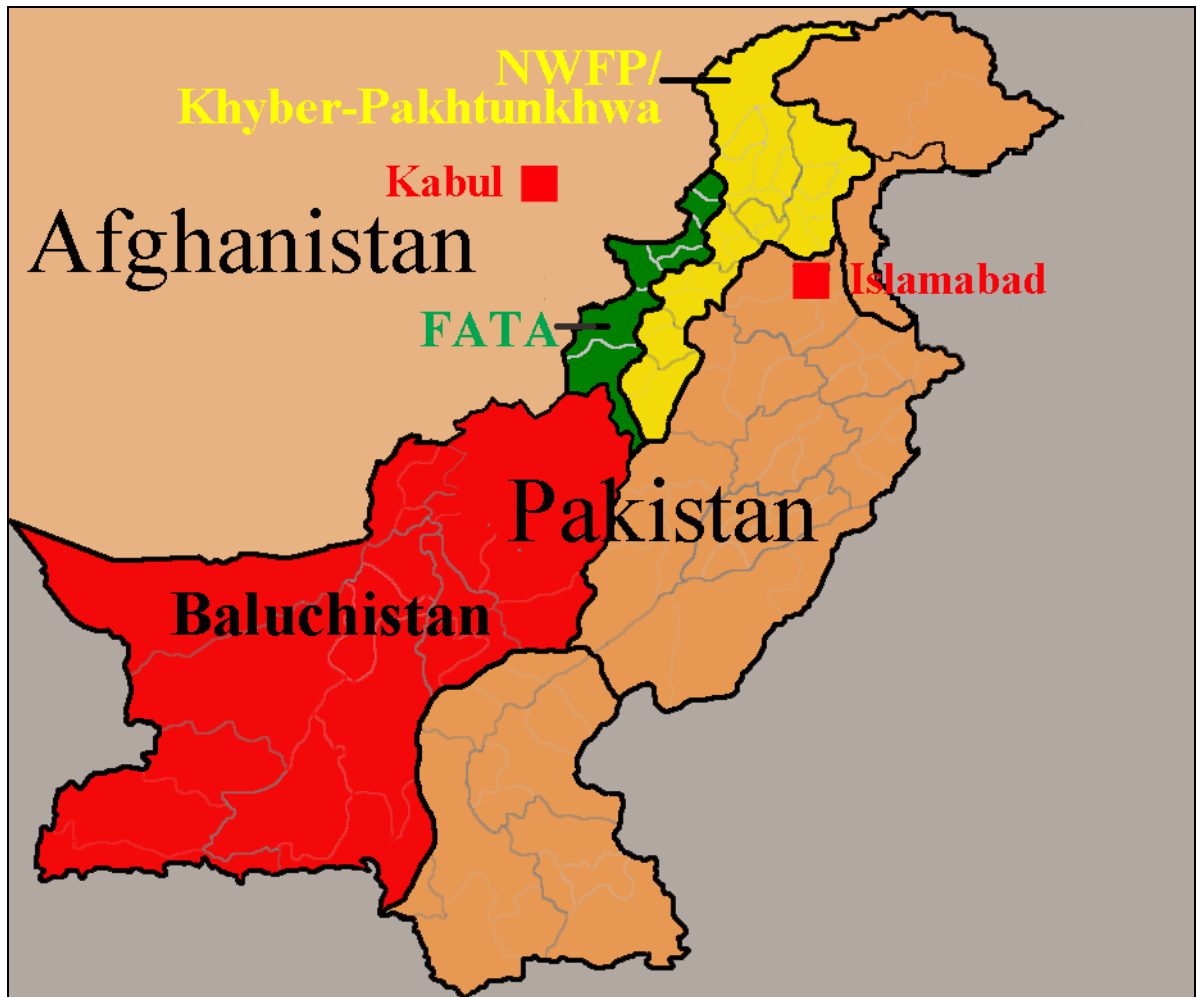
Map 2: The key border areas that could be further destabilised as a result of worsened law and order on the Afghan side of the border following the 2014 transition 8

Part one of this article analyses the current situation in the run-up to the crucial year of 2014. Part two then focuses on the situation in Pakistan, while part three looks at the regional and cross-border dynamics that affect both Afghanistan and Pakistan. Part four, subsequently, discusses the role of NATO in counter-narcotics policy in Afghanistan since 2003. Part five looks at broader regional and international initiatives that have been put in place to address the Afghan opium problem and its cross-border effects. Lastly, part six discusses a (worst-case) scenario in which the withdrawal of the foreign troops by the year 2014 will spark an opium war in Afghanistan and the border areas of Pakistan.