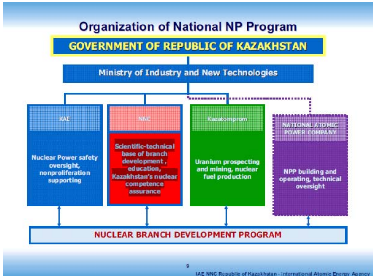
Fig. 3. Organization of National NP Program 36

Kazakhstan Atomic Energy Committee is the Nuclear Regulatory Body of the Republic of Kazakhstan. The principal fields of activity of the National Nuclear Center of the Republic of Kazakhstan are radioecology, nuclear power engineering and NPP safety, nuclear physics and radiation material science, nuclear-physical methods and high-end technologies, geophysics and non-proliferation, and personnel training. The NNC includes: the Institute of Nuclear Physics, the Institute of Atomic Energy, the Institute of Geophysical Research, the Institute of Radiation Safety and Ecology, the Baikal Enterprise, and the Kazakh State Research and Production Center of Explosive Operations.