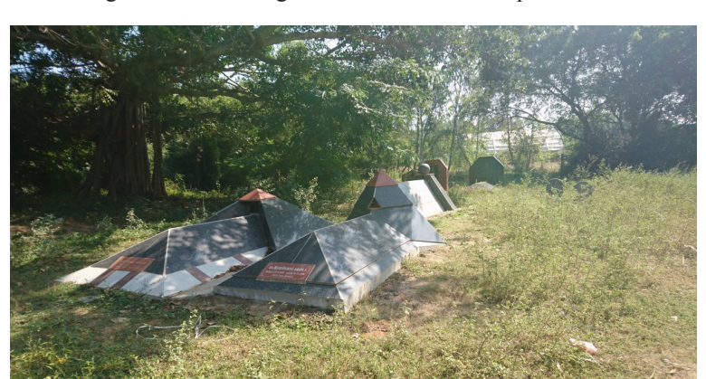
Figure 7. Auroville graves.

The narrow dirt track paths are being replaced with brick and tarmac roads – the main one of which was ready to welcome Modi – and there has been an exponential growth of private cars since the tsunami, private cars and mobile phones and even, hard for a 1968er to comprehend, separate gated communities. And the ecologists are on the back foot, with a proliferation of throwaway non-recyclable goods appearing in Auroville. It seems that on this common land which was bought from Tamils and enclosed to protect itself from the Tamil villagers, and whose labour it relies on to keep going, there are few common projects. Instead it is every man for himself, expected to live and let live and, better, encouraged to be an entrepreneur with a business from which a sizeable cut will go to the central authority. Businesses now include Australian spirulina, Austrian paper, Israeli wind-chimes and Tamil dolls (all of these national designations dissolved, of course, into an overarching 'Aurovillian' universal identity, and a host of organic cafes for the tourists who come to marvel at what has been done and what may be. The futuristic architecture of Auroville speaks of the hope of the commons but also of enclosure, a paradox built into the land. There is a simple graveyard with futuristic marble monuments surrounded by grassland