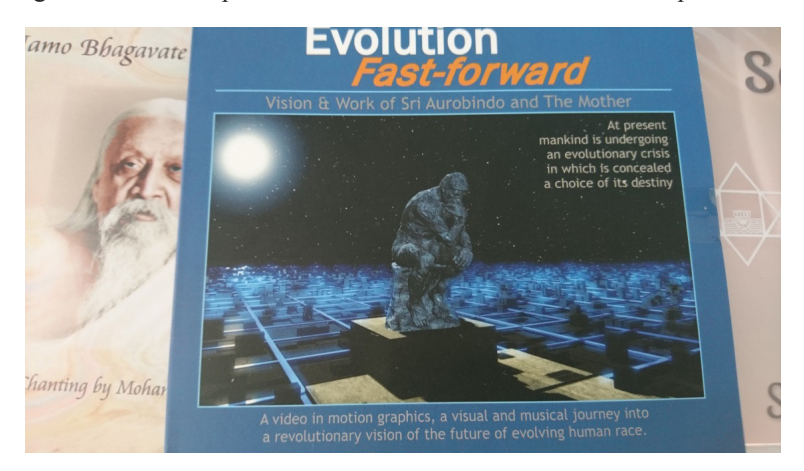
Figure 6. Auroville promotional DVD cover.

The narrow dirt track paths are being replaced with brick and tarmac roads – the main one of which was ready to welcome Modi – and there has been an exponential growth of private cars since the tsunami, private cars and mobile phones and even, hard for a 1968er to comprehend, separate gated communities. And the ecologists are on the back foot, with a proliferation of throwaway non-recyclable goods appearing in Auroville. It seems that on this common land which was bought from Tamils and enclosed to protect itself from the Tamil villagers, and whose labour it relies on to keep going, there are few common projects. Instead it is every man for himself, expected to live and let live and, better, encouraged to be an entrepreneur with a business from which a sizeable cut will go to the central authority. Businesses now include Australian spirulina, Austrian paper, Israeli wind-chimes and Tamil dolls (all of these national designations dissolved, of course, into an overarching 'Aurovillian' universal identity, and a host of organic cafes for the tourists who come to marvel at what has been done and what may be. The futuristic architecture of Auroville speaks of the hope of the commons but also of enclosure, a paradox built into the land. There is a simple graveyard with futuristic marble monuments surrounded by grassland