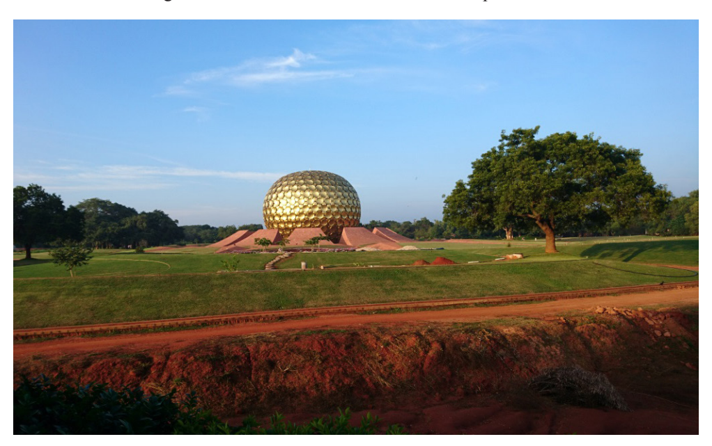
Figure 1. The Matrimandir.

Auroville is a futuristic city, at least that was the plan, and its fate tells us something about the nature of utopian projects and about 'the commons'. The commons were once our collective natural resources – land, air, water, energy – in the past, and are still there to be reclaimed together for the future. The commons will be ours again, taken from their enclosure as private property, and they ground every communist project. The commons were already there in many attempts to build utopian universal communities around the world, and there are glimmers of the commons now in many places, including in Auroville in south India. At its centre is the Matrimandir (Figure 1), of which more in a moment.