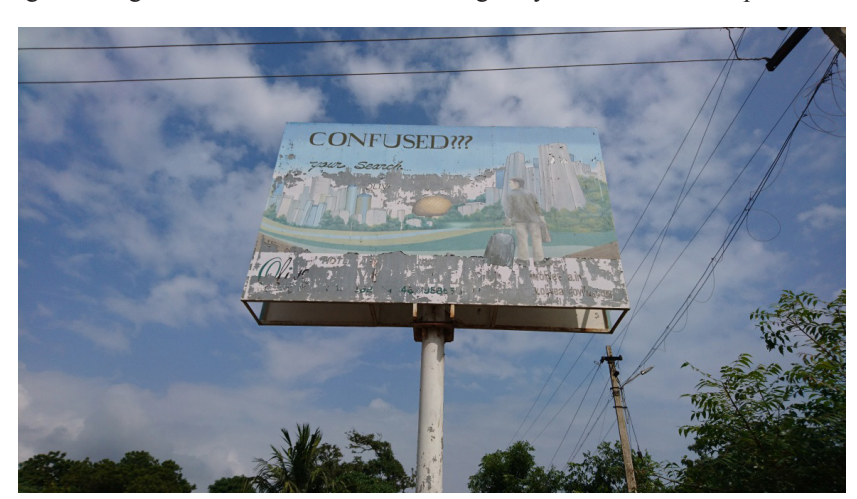
Figure 2. Sign for Auroville on the Pondi Highway.

In some strange way this 'city of the dawn' has its roots in anti-colonial struggle. Sri Aurobindo was one of the leaders of the movement against British imperial rule, and took refuge in Pondi in the early twentieth century to avoid arrest, turning to a spiritual life which is commemorated in the Aurobindo Ashram, still there in the French quarter known as 'White Town'. After Sri Aurobindo died his partner Mira Alfassa, a French national from Morocco known as 'The Mother' gathered together followers to keep a legacy alive that would, she claimed, be spiritual, universal, as opposed to religious or ethnically particular. The Mother directed the construction of Auroville, and her image is still very much present there (Figure 3).