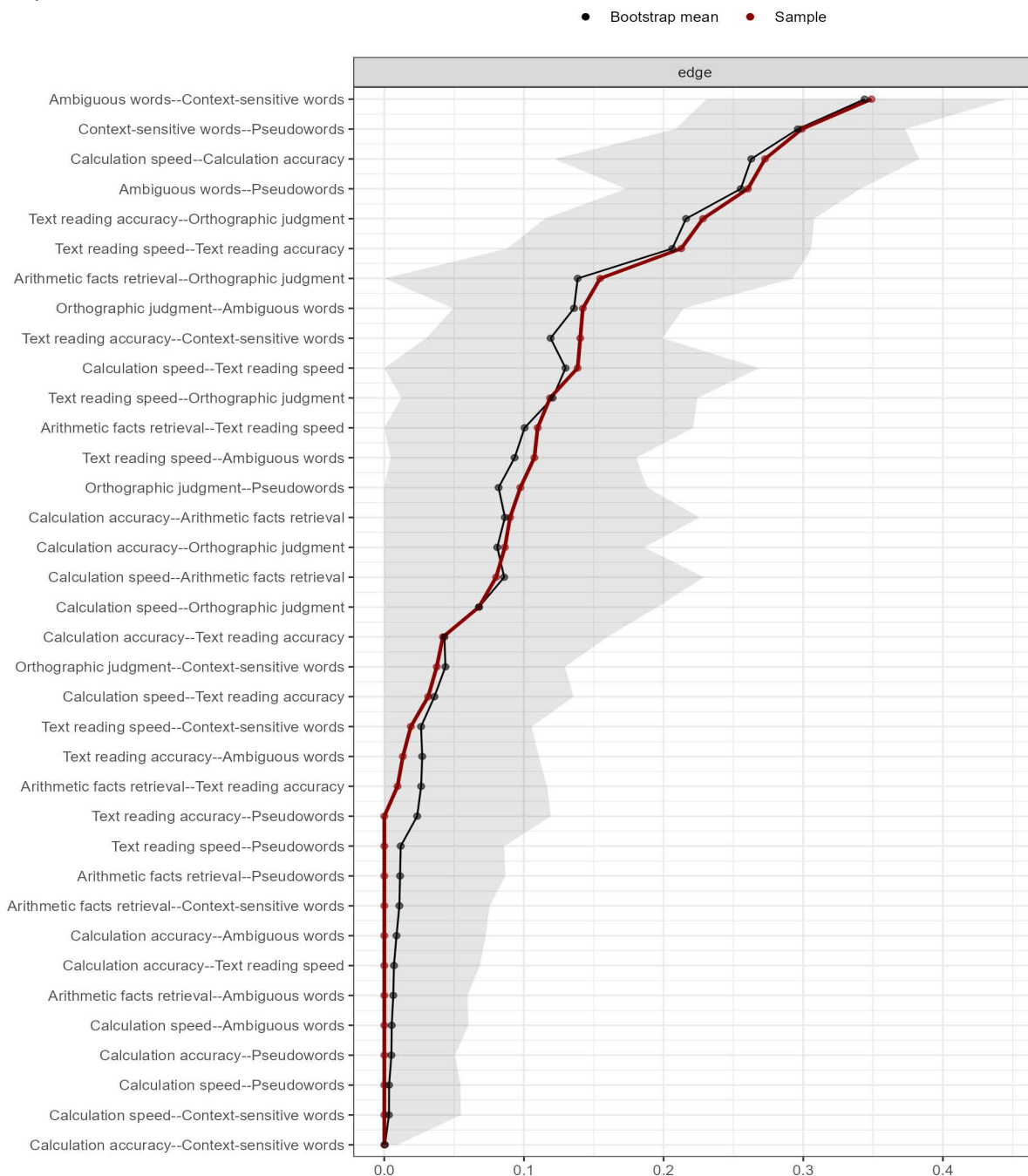
Figure 3. Full list of edges and results from the 1000 bootstraps. Red dots indicate the edge value the estimated network. Black dots indicate the average edge value over 1000 bootstrap resampling. The grey shadow represents the 95% confidence interval estimated with the bootstrap resampling. Edges are ordered by their estimated strength.

Several key observations originate from an analysis of Figures 2 and 3 and Tables 1 and 2 based on our general expectations.