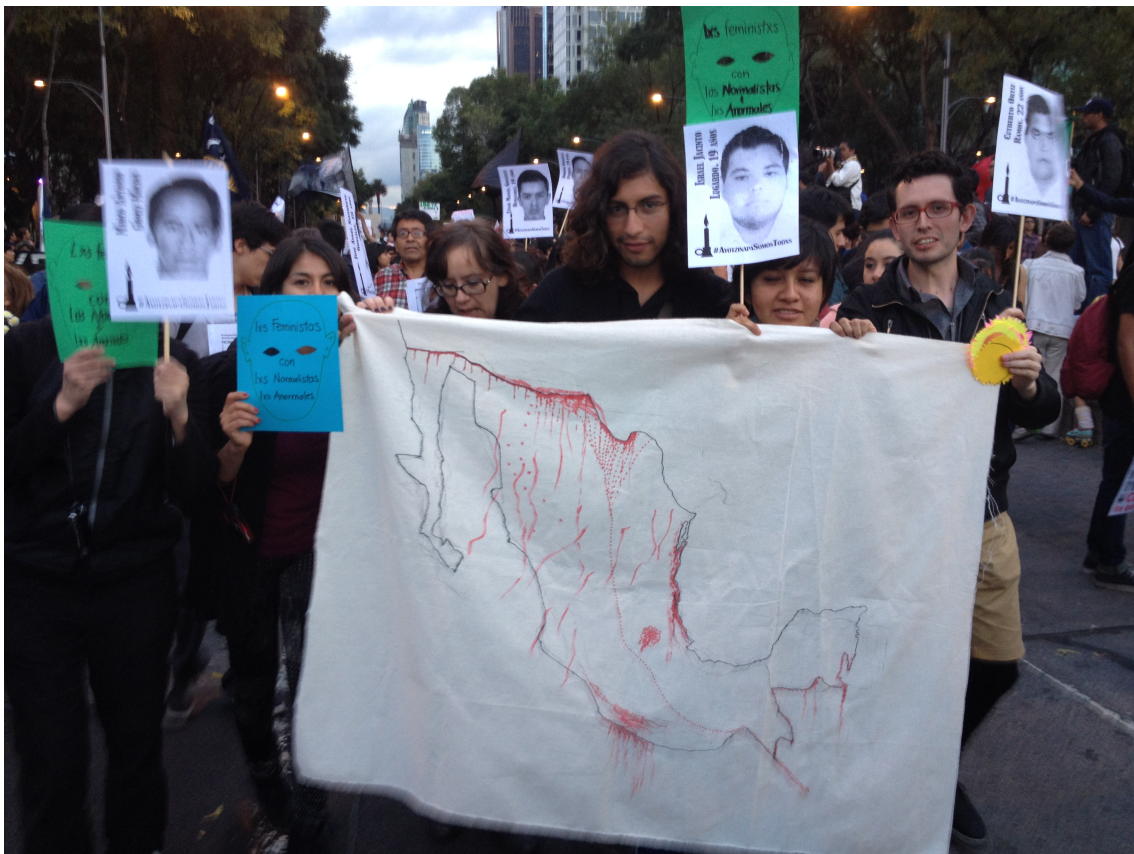
Students of the Visual Culture and Gender graduate course-UNAM, during the demonstration "Una luz por Ayotzinapa" ("A light for Ayotzinapa"). Mexico City, October 22nd, 2014.