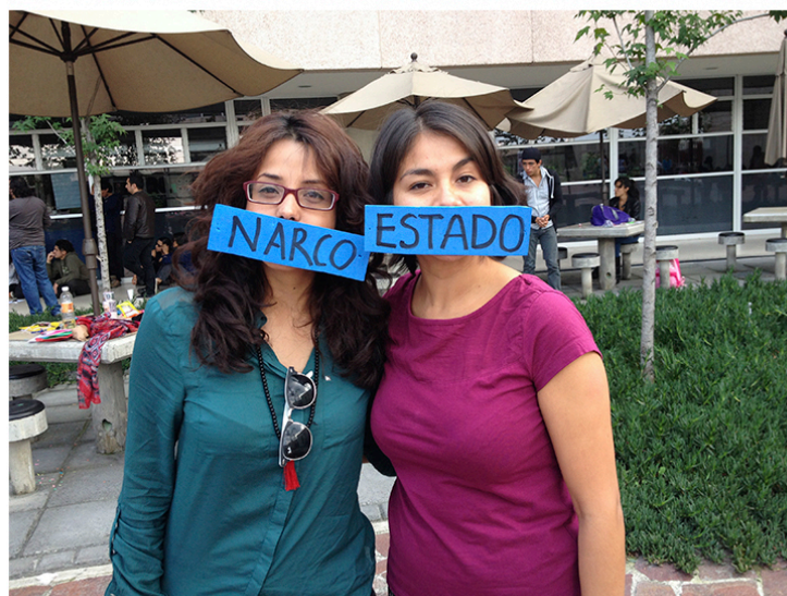
Visual Culture and Gender, UNAM Graduate seminar. October 22 nd, 2014.