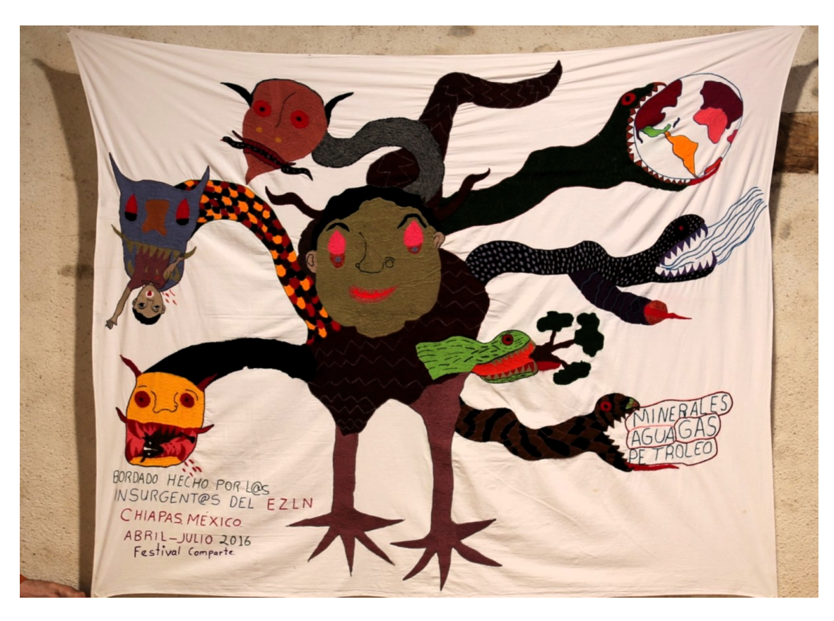
Hidra 1 ('Hydra 1'), Cloth embroidered by EZLN insurgents. (1.87m \times 1.7m).

The whole composition of this work summarises that which, for the Zapatistas, means autonomy, anchored to the Earth (to the whole world) and to "simple", everyday activities, not unconnected to the permanent attacks by the government that the Zapatistas have learnt not to accept and instead "turn on their head", in order to carry on with a struggle embarked upon by their ancestors, who "have given the strength to the people to keep fighting" 18.