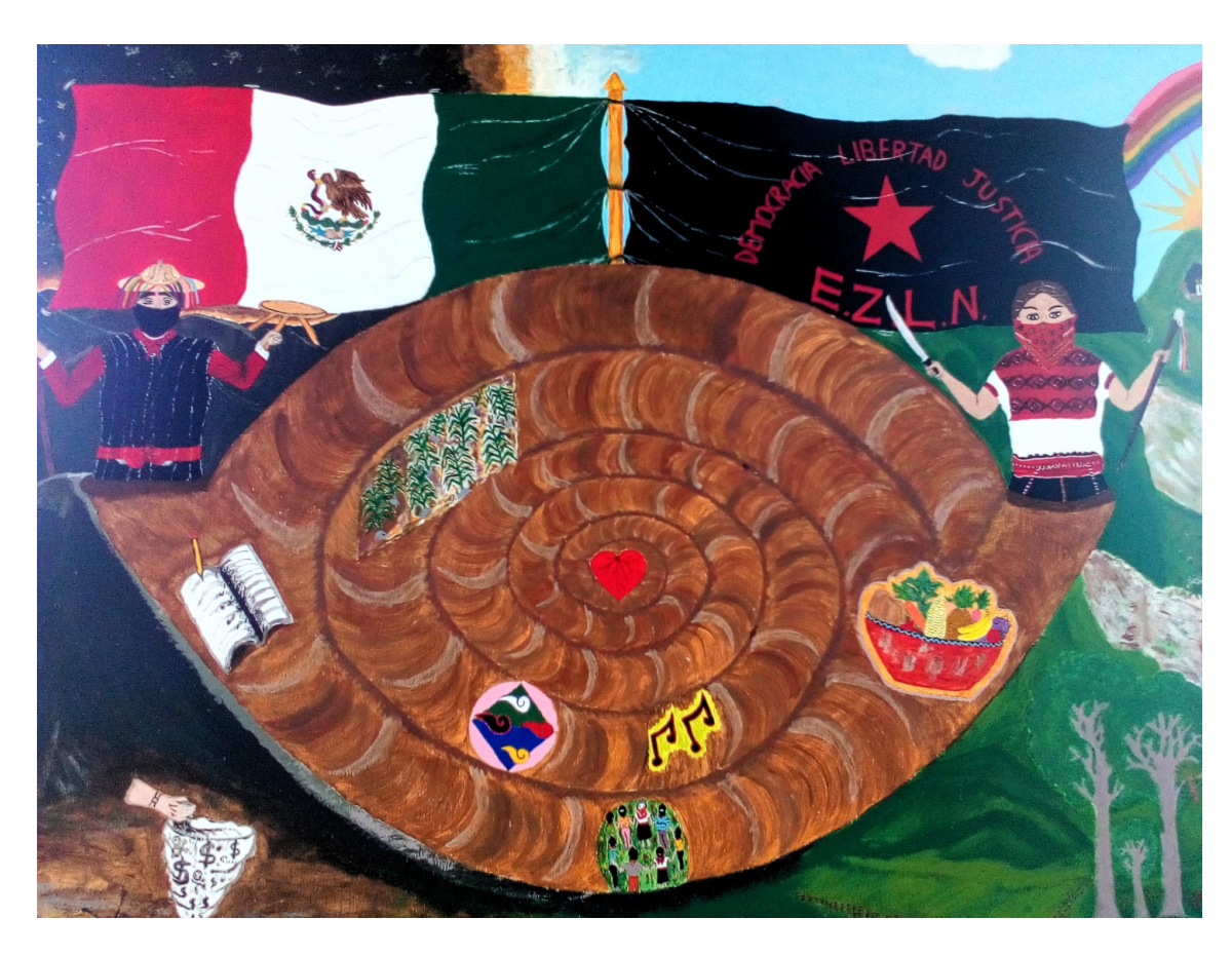
Libertad ('Freedom'), vinyl paint. Caracol IV of Morelia (1.5m \times 1.5m).

This is reiterated by the words of Subcomandante Moisés, who, two years beforehand, referred to art practice as something no longer considered a commodity, but rather a combination of creative forces that are able to reconstitute reality: