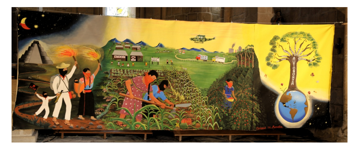
Autonomía ('Autonomy'), vinyl paint on cloth. Caracol IV Morella (5m x 1.7m)

By analysing some of the works that comprise this exhibition, it is possible to observe modes and forms in which the Zapatistas place their experiential knowledge, and they share with the world, simply and generously, their modes of being and doing.