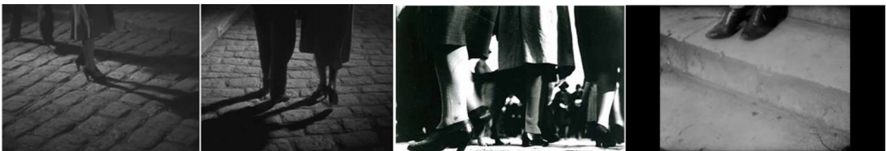
Fig. 6. First two images on the left: frames from Under the Roofs of Paris , 1930. Third from the left: Photograph by Eli Lotar. On the right: Frame by Ménéilmontant , Dimitri Kirsanoff, 1926.

This other perspective seeks to pose the camera at all the points of the urban geography that may have some poetic or political interest echoing the Benjaminian figure of the “ragpicker,” who gathers the discarded remnants, the leftovers of Modernity. Markets, slaughterhouses or rubbish dumps are the settings of his works—as in Georges Franju’s short films. In that regard, Clair’s affiliation with this trend leads him not only to propose completely irreverent plots when dealing with the icons of the Parisian center, but also not to neglect the popular districts—proof of this are Under the Roofs of Paris or The Million . In the way of photographers Eugène Atget, Brassai or his friend Eli Lotar, Clair walks around (or evokes in the study) these neighborhoods looking for those exceptional moments of life. He films them between reality and fable, from risky angles (from the ground or the picturesque roofs emerging in the middle of an enigmatic fog). He also isolates details that are very popular with the symbolic Surrealist (shoes, hats, gloves) to denaturalise them or follows a couple in love in the footsteps.