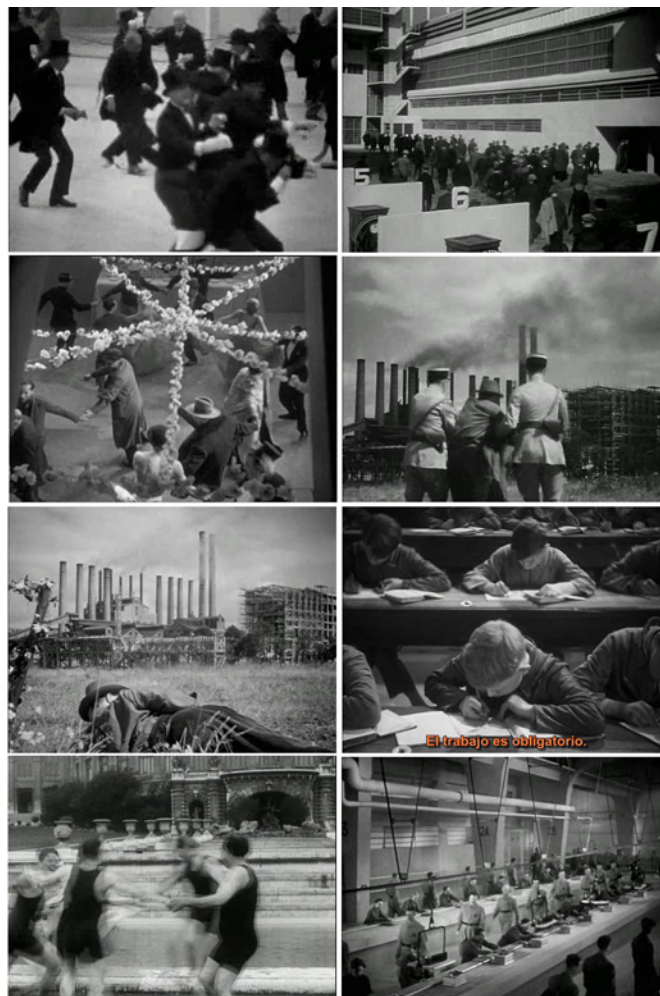
Fig. 4. Frames of Freedom for Us and Under the Roofs of Paris , 1930, by René Clair.

Without actually offering a solution, the rejection of the excesses of work, the real opposite of those libidinal and creative excesses, runs completely through the Surrealist movement. From the writings of Roger Caillois or Georges Bataille in defense of parties, passions and unproductive spending—“Eroticism cannot be