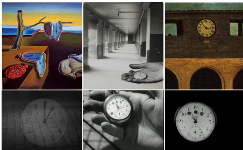
Fig. 2. Above left: The Persistence of Memory , Salvador Dalí, 1931; Up in the centre: Hôpital des Quinze-Vingts , Eli Lotar, 1928. Top left: Enigma of the Hour , Giorgio de Chirico, 1911. Below left: Frames of Under the Roofs of Paris , 1930, and The Crazy Ray , 1924, René Clair.

Paris Asleep is a fable that tells the story of a night guard at the Eiffel Tower who wakes up one morning to discover that the entire city has fallen into a deep sleep. The clocks do not work, and everything appears to be still—something common in Surrealism.