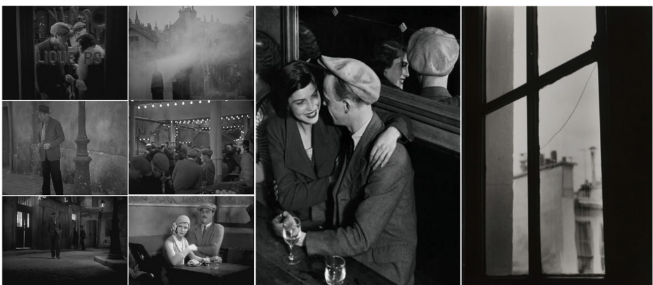
Fig. 7. The two columns on the left: frames from Under the Roofs of Paris , René Clair, 1930. Two images on the right: photographs by Brassai and Eli Lotar.