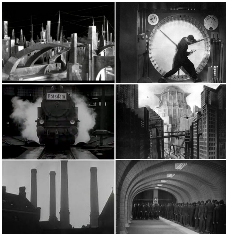
Fig. 5. Top left: Frames from Aelita , Yakov Protazanov, 1924; On the right and the middle frame on the left: Metropolis , Fritz Lang, 1927 and below left: Berlin. Symphony of a Great City , Walter Ruttmann, 1927.

Using the same narrative scheme as James Joyce's Ulysses –the cycle of any given urban day–, all these films deal with the passage of time, the rhythms of the day, the succession of hours, hinting at the cataclysm that it would suppose that the urban cadences stopped suddenly, in the way that happens in The Crazy Ray , by René Clair (1999, 71).