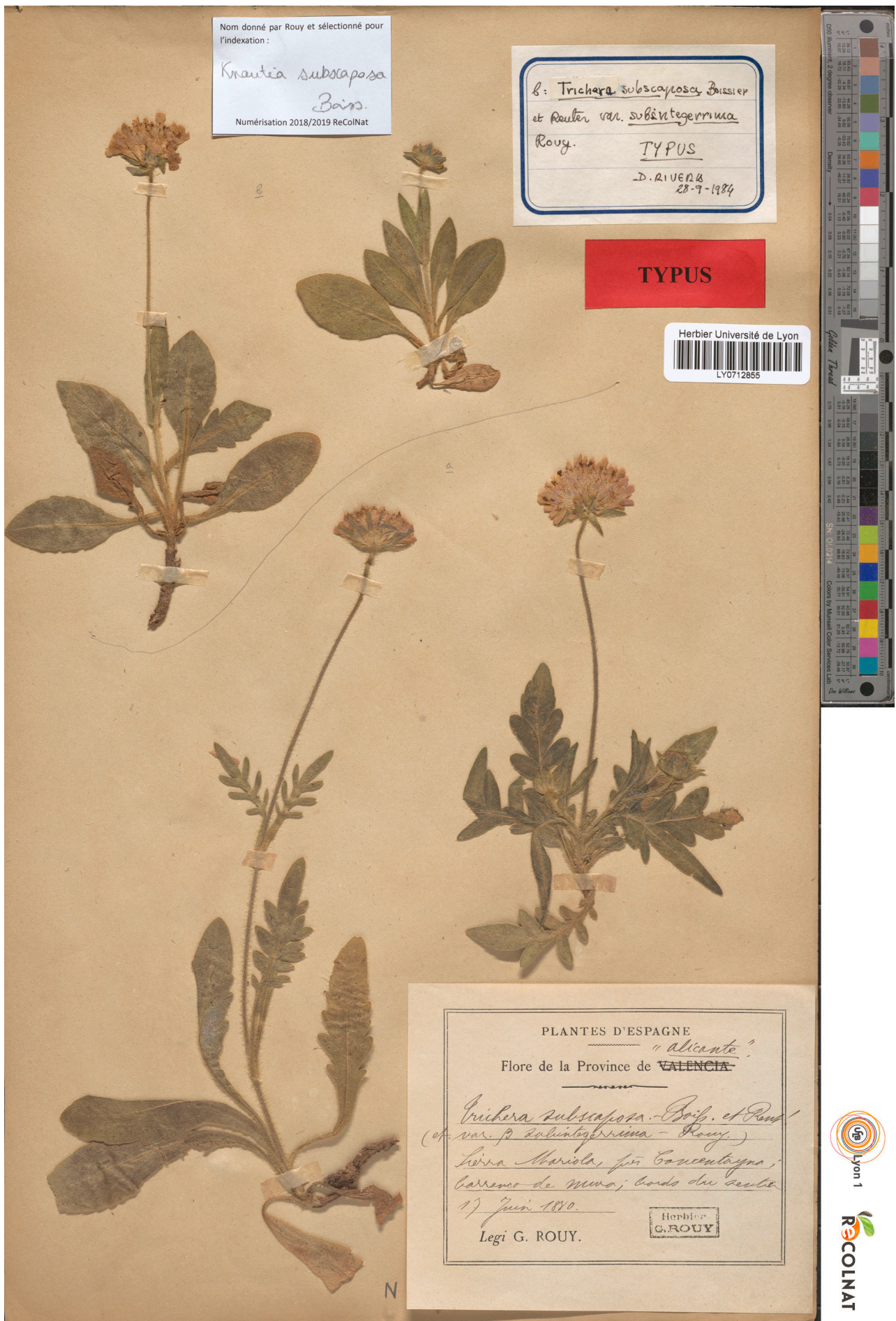
Figure 3. Lectotype of Knautia subscaposa var. subintegerrima Rouy; LY 0712855 (Image courtesy of the herbarium LY, reproduced with permission).