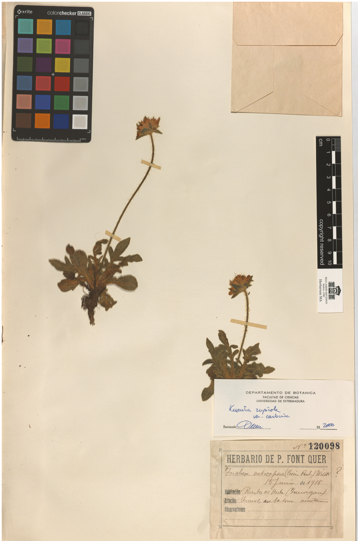
Figure 2. Lectotype of Knautia rupicola var. macrotrycha (Pau ex Font Quer) Devesa; MA 120098 (Image courtesy of the herbarium MA, reproduced with permission).