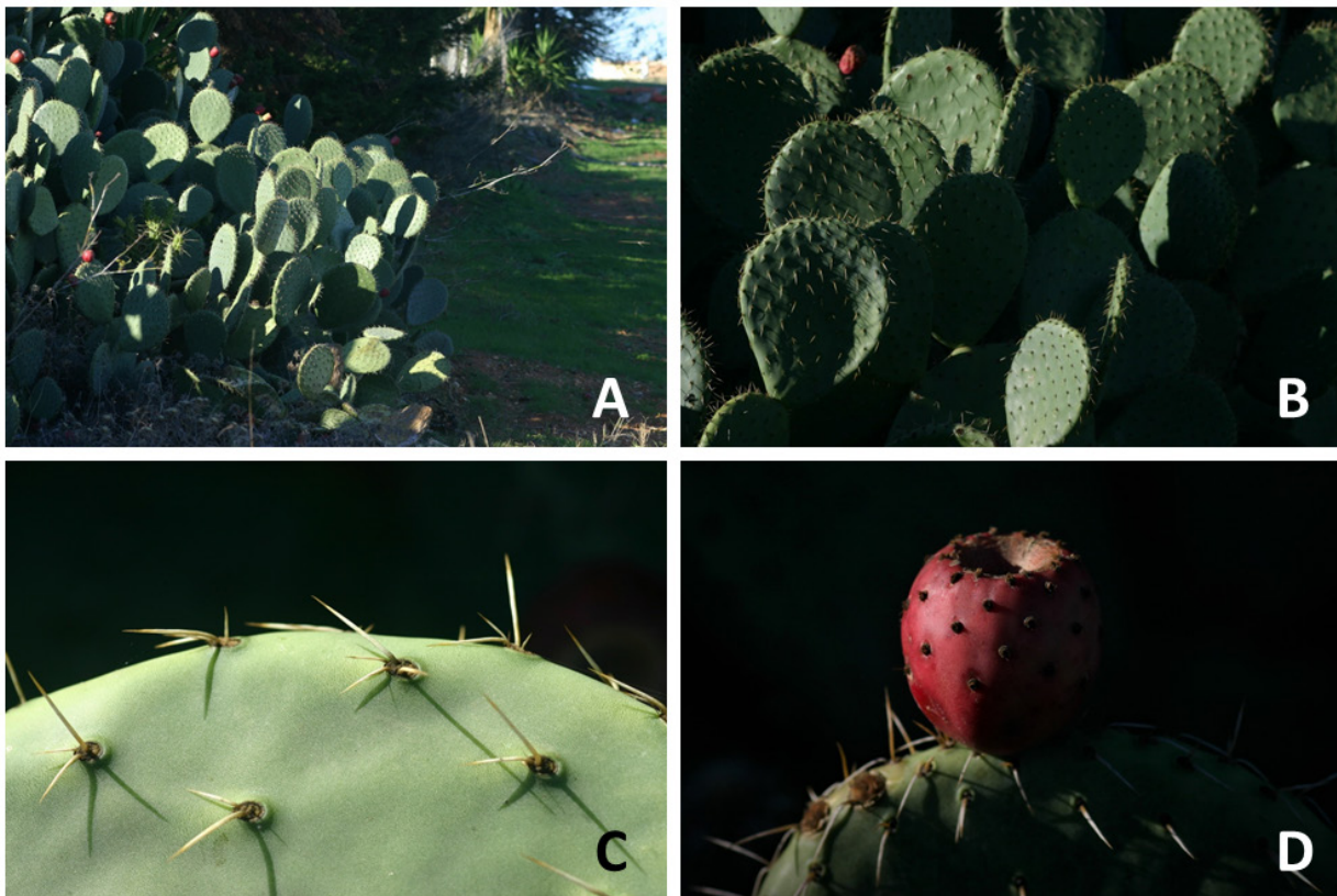
Figure 1. Opuntia streptacantha . Ayamonte, November 2018, E. Sánchez Gullón. A) Habit; B) Detail of stem segments; C) Detail of spination; D) Detail of fruit.

Opuntia leucotricha (Figure 2 A-C) is readily distinguished based on the following characters: plant tree-like (3–5 m tall at maturity) with a definite trunk that is covered in up to 8 cm long, white-greyish hair-like spines, cladodes are greyish-green, oblong ca. 14–28 × 11–15 cm, with a distinctly velvety indumentum and areoles are not impressed, fruits are usually yellowish white (rarely purplish red) (Scheinvar, 1974; Bravo-Hollis, 1978; Walters et al. , 2011).