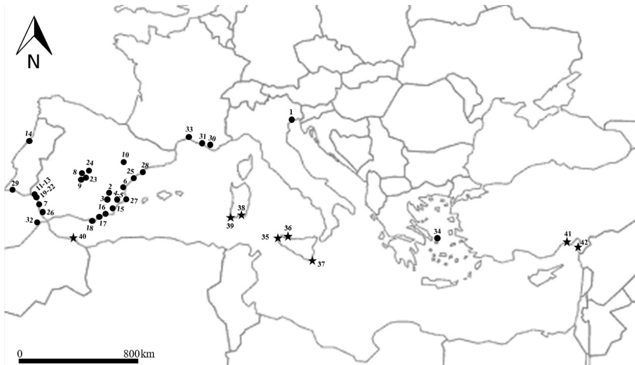
Figure 1. Map showing the distribution of Arthrocaulon macrostachyum (points) and A. meridionalis (stars). Numbers refer to localities and populations listed in Appendix 1.

Distribution. This species occurs on the islands of Sicily and Sardinia and in circum-Mediterranean territories from North Africa to the Anatolian Peninsula in Turkey. Other populations not included on the map: Iran: between Gavbandi and Kangan, Bidkhoon, 2.12.1987, Assadi & Akhani 64014 (TARI Herbarium), 2n=18 , Figure 1.