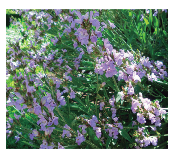
Figure 1. - Salvia lavandulifolia Vahl.

About 25% of modern drugs are originated from plants either directly or indirectly. Phytochemical and pharmacological researches carried out during last years confirm many traditional uses of Salvia genus in central nervous system di-