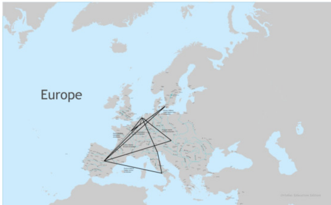
Figure 4: News from Spain. Prepared by the author