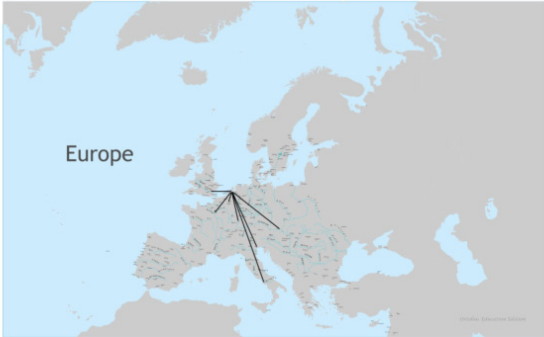
Figure 2: Main news supplying centres to the Gazeta de Amsterdam . Prepared by the author

Original or not, the news items selected by Castro Tartas and his followers show the importance of some European foci of information. First of all, this map shows clearly which were the main town in Europe which acted as a hub of news: