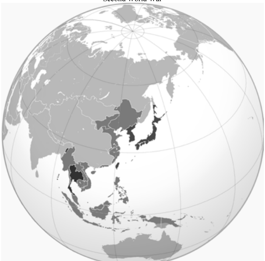
Figure 2. Area of the Japan-led Greater East-Asian Co-prosperity Sphere during the Second World War

world-historical mission, Nishida believed that Japan would be the only candidate to restore the mission.