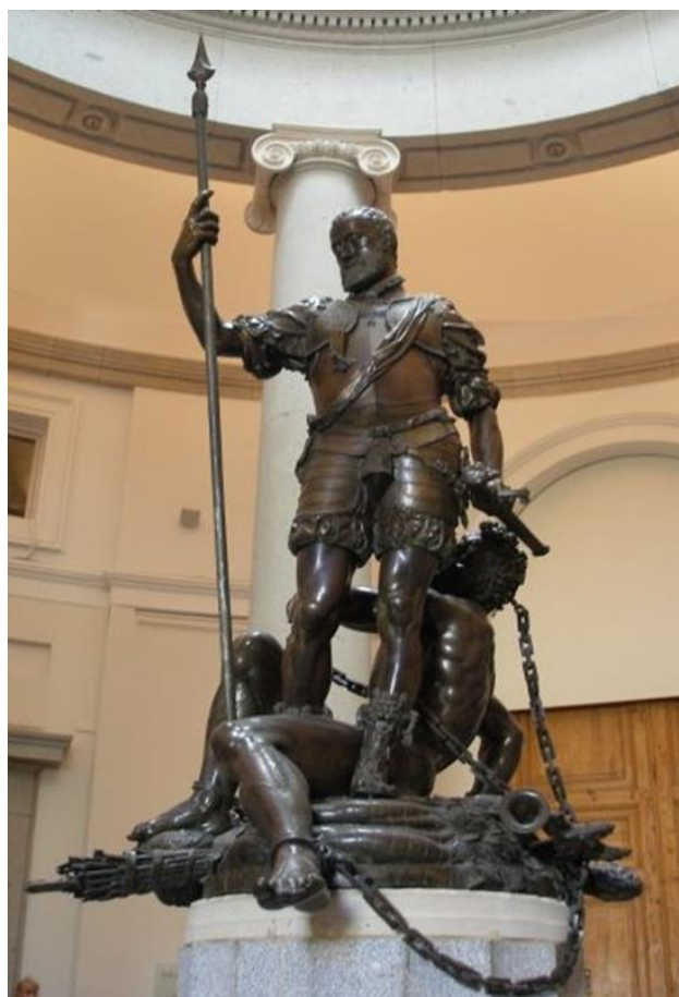
Fig. 1. Leone Leoni & Pompeo Leoni, Charles V and the Fury, 1549-1564, bronze. Prado Museum, Madrid.).