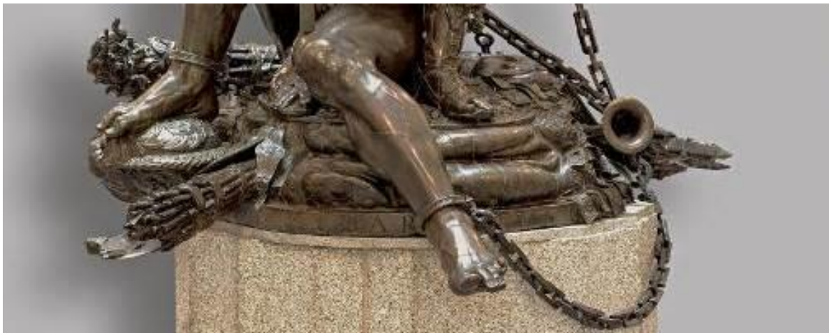
Fig. 4. Leone Leoni & Pompeo Leoni, Charles V and the Fury , detail of the pile of military accessories. Prado Museum, Madrid.

Textually, the figure of Fury was inspired by Virgil's Aeneid in which Jupiter describes the end of war, marked by the closing of the gate of the Temple of War, with unholy Furor enchained inside. In this sense, in Leoni's image, Charles become a new Augustus, heralding the Emperor for bringing peace to Christendom. However, letters from Leoni to Charles's advisor, the bishop of Arras Antoine Perrenot de Granvelle, reveal that the work was originally intended to be a sole nude portrait of the Emperor (fig. 5 and fig. 6), and that Leoni independently came up with the idea to add both the figure of Fury (in December 1550) and the removable armor (in June 1551). Indeed, the armor can be removed by leaving nude the Emperor (fig. 7). Furthermore, it is noteworthy that this sculpture could refer to a real and specific Charles's triumph on the battlefield: that of Mühlberg on April 24 th , 1547, a victory that represented for Charles the defeat of the Protestant faith by Catholicism.