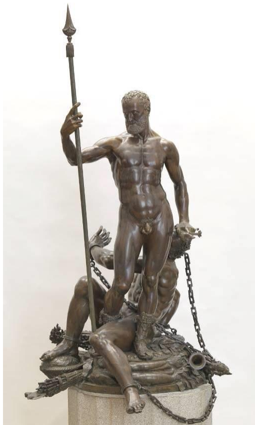
Fig. 7. Leone Leoni & Pompeo Leoni, Charles V and the Fury , detail of the portrait of the Emperor without armor. Prado Museum, Madrid.

(if anything, in a given cultural environment, they can present the visual dialogue on royal authority among different authors, and their messages thus represented the different opinions on this issue 27 ).