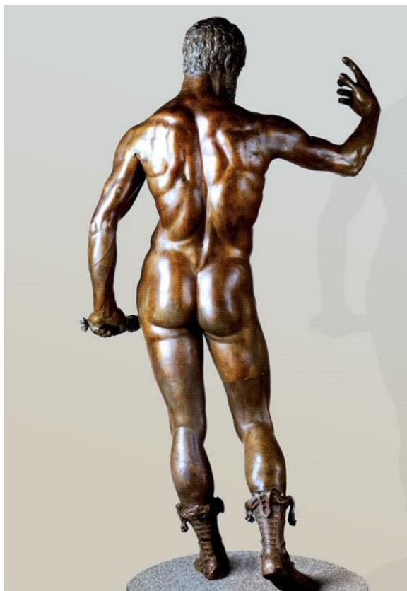
Fig. 5. Leone Leoni & Pompeo Leoni, Charles V and the Fury, detail of the nude portrait of the Emperor, bronze sculpture, 1549-1564. Prado Museum, Madrid.