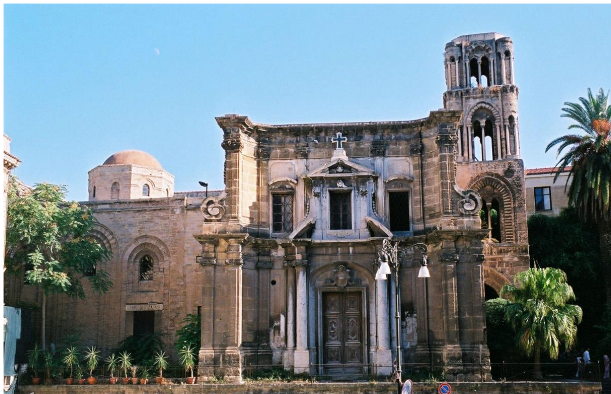
Fig. 8. Current facade. Church of St. Mary of the Admiral, Palermo.