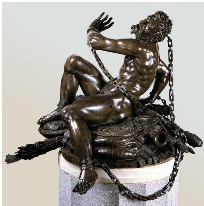
Fig. 2. Leone Leoni & Pompeo Leoni, Charles V and the Fury , detail of the nude figure of the defeated Fury, Prado Museum, Madrid.