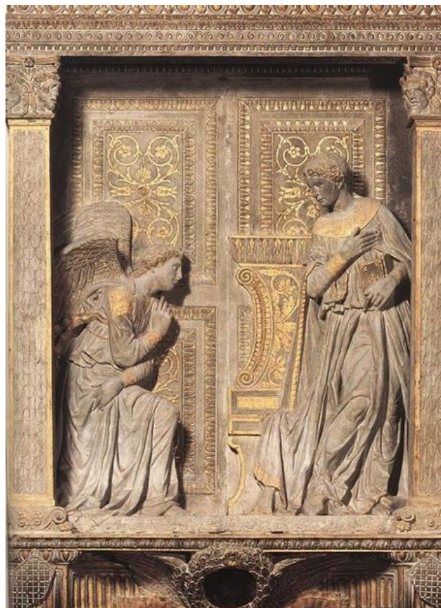
Fig. 2. Donatello, The Cavalcanti Annunciation , c. 1435. Cappella Cavalcanti, Basilica di Santa Croce, Florencia

DONATELLO, THE CAVALCANTI ANNUNCIATION , c. 1435. CAPPELLA CAVALCANTI, BASILICA DI SANTA CROCE, FLORENCIA