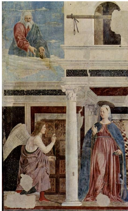
Fig. 6. Piero della Francesca, The Annunciation , c.1455, church of Saint Francis, Arezzo.

Piero della Francesca (1415/20-1492) stages The Annunciation , c.1455, frescoed in the church of Saint Francis in Arezzo (Fig. 6). into a composition patterned according to the golden ratio. In the context of a monumental Renaissance palace, Gabriel begins to kneel before the Virgin in the outer courtyard, while he blesses her with her right hand. Majestically standing within the palace, Mary turns slightly towards the heavenly herald to hear her message. What is interesting to highlight here for our purposes is the closed door that, on the back wall, establishes the link between the angel and the Virgin.