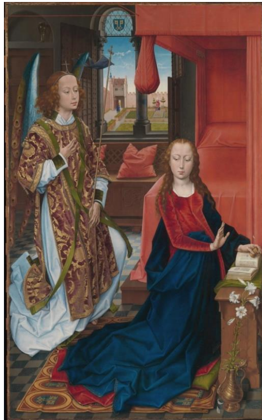
Fig. 7. Hans Memling or workshop of Roger van der Weyden, The Clugny Annunciation , c. 1465-70. The Metropolitan Museum, New York.

HANS MEMLING OR WORKSHOP OF ROGER VAN DER WEYDEN, THE CLUGNY ANNUNCIATION , C. 1465-70. THE METROPOLITAN MUSEUM, NEW YORK