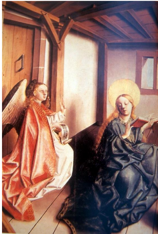
Fig. 4. Konrad Witz, The Annunciation , c. 1440. Germanisches Nationalmuseum, Nuremberg.

Konrad Witz (1410-1445) stages The Annunciation , c. 1440, from the Germanisches Nationalmuseum in Nuremberg (Fig. 4), in a modest room, with thick wooden beams and no furniture, with a certain appearance of a hut. In that rustic enclosure, the archangel Gabriel communicates to the Virgin the Almighty's plan, after his initial salutation Ave Maria gratia plena Dominus tecum (Luke 1:28), inscribed on the unfolded phylactery that he carries in her left hand. Interrupting the reading of the book that she keeps open in front of her, Mary turns her head slightly towards the heavenly herald to dialogue with him. For our purposes, the most notable thing in this painting is the solid wooden door that remains closed behind Gabriel's back. It seems evident that the intellectual author of this painting wanted to highlight this closed door with the purpose of visually alluding to the five Mariological and Christological meanings underlying Ezekiel's porta clausa according to the Fathers, theologians, and liturgical hymnographers of the Eastern and Western Churches.