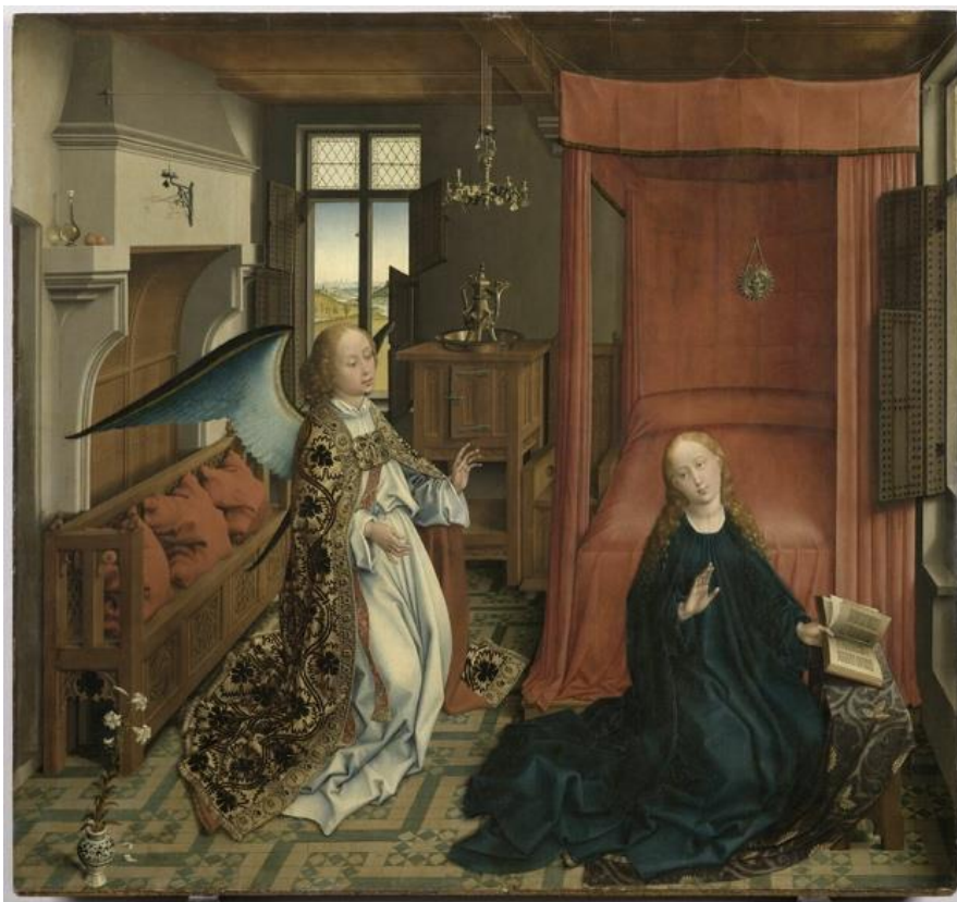
Fig.3. Rogier van der Weyden, The Annunciation , central panel of The Annunciation Triptych , c. 1440. Musée du Louvre, Paris.

we cannot expose here, as we have already explained them extensively in another study. 126 However, we are interested in highlighting on the left side edge the almost imperceptible closed door through which the archangel Gabriel entered without opening it. It seems reasonable to assume that the intellectual author of this painting –perhaps a friar or ecclesiastic who instructed van der Weyden in this sense– decided to include in this Annunciation a closed door to visually illustrate the five dogmatic meanings already explained about the closed door of Ezekiel.