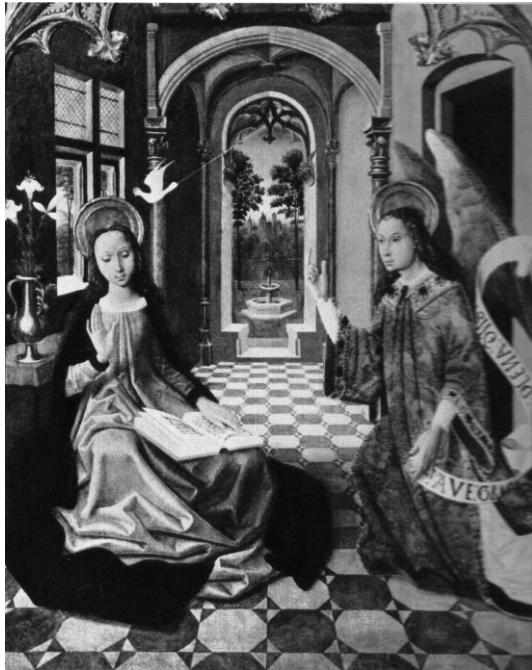
Fig. 8. Master of Canapost, The Annunciation , panel of the Altarpiece of Puigcerdà , MNAC, Barcelona.

hands crossed on her chest, gives her, however, another psychological expression: instead of imagining her downcast and fearful, he figures her entrusted and determined, raising her eyes toward the Holy Spirit's dove, which flies toward her in the absence of the divine ray. Linking both characters, without the support of the usual phylactery, an epigraphic inscription proclaims the Gabriel's laudatory salutation: Ave gr[atia] plena d[omi]n[u]s tecum.