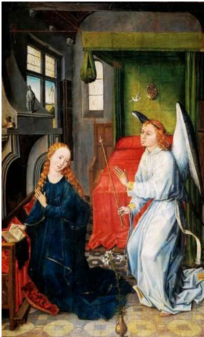
Fig. 9. Master of Sopedrán, The Annunciation , end s. XV. Prado Museum, Madrid.

snowy white lilies arises from a jug, that, in perfect symmetry with the white dove, set with it a chromatic and conceptual link around the Virgin's head, in perfect correspondence with the profound dogmatic content that are enclosed in the image of the Annunciation with stem of lilies, as will be explained later.