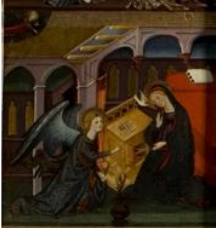
Fig. 1. Pere Serra, The Annunciation , panel of the altarpiece of the church of Sant Llorenç de Morunys.

In the Spanish Gothic art, the same as in the medieval European, the images of the Annunciation with stem of irises are countless. However, to better focus the iconographic study proposed in the current paper, we have chosen here, for analysing them, ten Gothic Spanish paintings representative of that item.