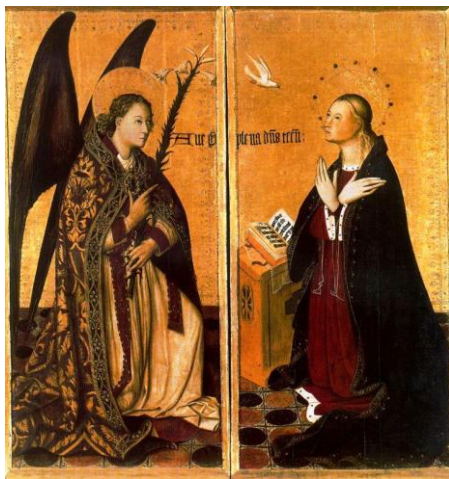
Fig. 7. Jaume Jacomart (or Lluís Dalmau), The Annunciation , c. 1411-61. Fine Arts Museum, Valencia.

It is interesting the fact that in this painting the artist, besides removing the divine ray and the presence of God the Father, introduces into the architectural scenography, with aberrant perspective, a varied set of details of everyday life: such are the instruments of writing and reading in the desktop, the household chattels on the shelf, or the curtains which ensure the privacy of the bed, as well as a series of anecdotal postures, as the cat chasing a mouse in the outer space or the bird drinking in a basin. In any case, the artist also places here in a central place in the foreground a leafy bouquet of lilies, which arise from the narrow bottleneck of a precious jug.