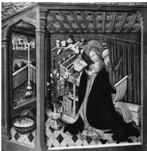
Fig. 6. Jaume Ferrer II, The Annunciation , panel of the Retaule de la Verge dels Paers , Lleida, c. 1450-1455.

archangel holds a long fleur-de-lys patterned sceptre in his left hand, from which he deploys, in turn, a band with the salutation inscribed in it: the painter's decision of interconnecting the two protagonists through such phylactery is interesting in this sense, perhaps to better illustrate the dialog between both, symbolized precisely by such epigraphic support. In addition, kneeling on her pew, covered with rich cloak and with her hands crossed on her chest, the Virgin returns with shyness her gaze to the visitor, distancing her away from the prayer book open on the lectern. Meanwhile, on the outskirts of the house –with appearance of gothic chapel— of the maiden, God the Father, surrounded by red cherubim, pumps through the circular window the breath of life, bearer of the divine Spirit's dove, which flies swiftly toward the head of Mary to fertilize her per aurem . As an eloquent appeal, Huguet places in the center of the composition, above the phylactery and under the ledge of the gothic window, a voluminous bunch with three lilies, which, in addition to interrelate the two dialoguing figures –or, to be more exact, the contents of their respective speeches—, sets a clear symbolic bond with the landscape in pristine condition that can be seen by the window.