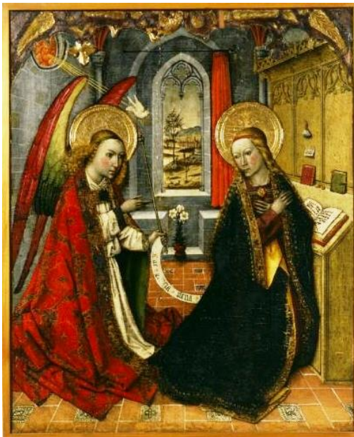
Fig. 5. Jaume Huguet, The Annunciation , panel of the Altarpiece of the Mother of God , from Vallmoll, c. 1450. Museu Diocesà of Tarragona.

Jaume Huguet (c. 1415-1419), in The Annunciation of the Altarpiece of the Mother of God , painted toward 1450 for the church of Vallmoll, and today in the Museu Diocesà of Tarragona (Fig. 5), introduces a series of particularly attractive resources. Coated with luxurious coat of purple with brocade, the ruddy