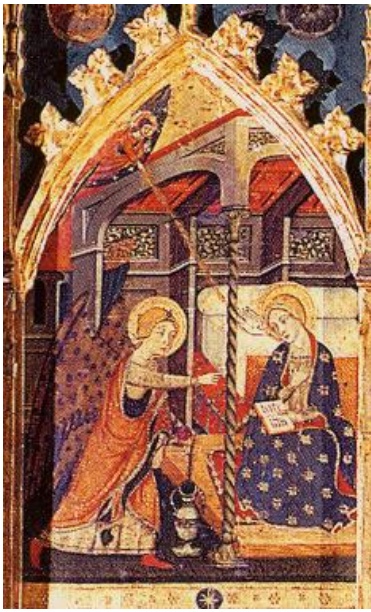
Fig. 2. Master of Sigena, The Annunciation , panel of the Sigena Altarpiece .

to wish to reinforce the symbolic meanings that, as it will be seen later, such flowers enclose.