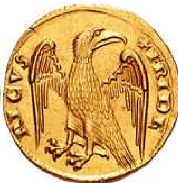
Fig. 9. Augustale , Museo Archeologico Nazionale, Napoli.