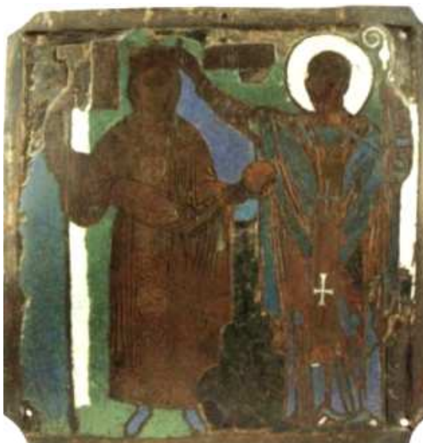
Fig. 1. Saint Nicolas blesses Roger II . Museum of the Basilica of San Nicola, Bari.

is not the primary aspect of the representation of these rulers, and, moreover, it is not absolutely constant for the period that I have analysed. For example, while it is present during the Norman period (for example Roger II is depicted with Saint Nicolas blessing him on his crown in the little plaque from the ciborium of the Basilica of San Nicola in Bari (Fig. 1); or respectively Roger II and William II are depicted with Christ crowning them in the mosaic of the church of Santa Maria dell'Ammiraglio in Palermo and in that of the cathedral of Santa Maria la Nuova in Monreale (Fig. 2 and Fig. 3), it completely disappears in the following years, only to come back during the reign of Robert of Anjou, though in a very different manner –Robert is often shown in a simple act of devotion toward Christ or Saint Ludwig of Toulouse: for example in the fresco of Lello of Orvieto in the Convent of Santa Chiara in Napoli (Fig. 4); in the painting of the Master of the Tempere Francescane (Fig. 5); as well as in the painting of the Master of Giovanni Barrile (Fig. 6)—. Moreover, sacrality appears very limited in comparison with the traditional opinion of historians, and absolutely never in the form of king as rex et sacerdos , christomimetes and imago Dei . These concepts appear not to belong to the representation of power in the kingdom of Sicily.