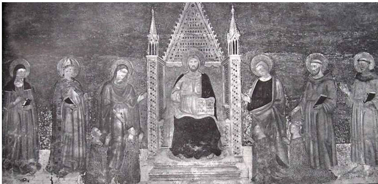
Fig. 4. LELLO OF ORVIETO, Christ, saints, and Angevin royal family , Convent of Santa Chiara, Napoli.