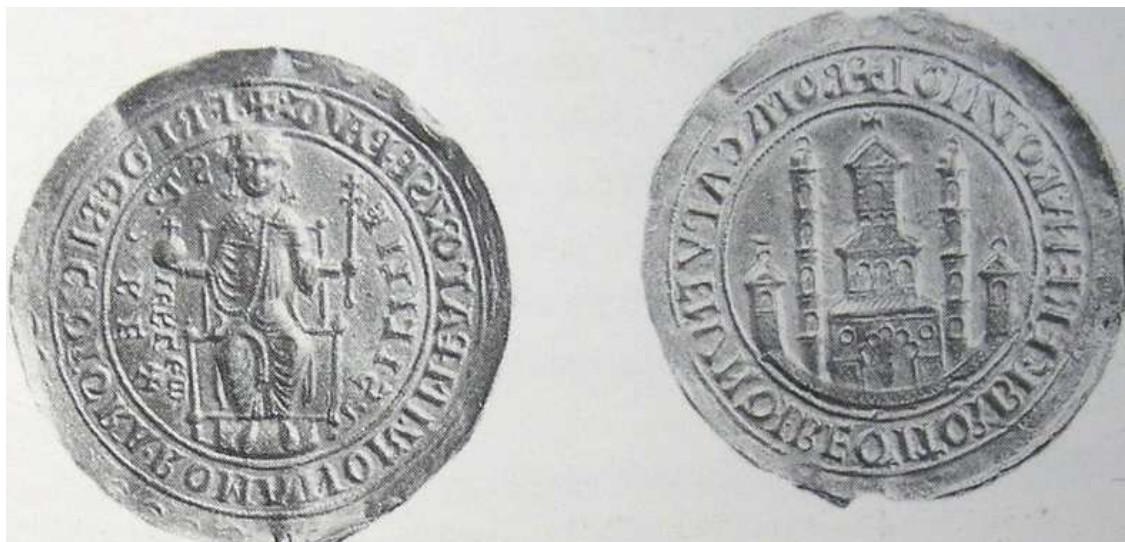
Fig. 10. Imperial bull of Frederick II , Generallandesarchiv, Karlsruhe.

In the last few years historians have produced a number of new studies dealing with representations of Frederick II. For my own part, I have recently reevaluated both dubious and genuine likenesses of the king present in sphragistics, numismatics, glyptic, jewelry, sculpture, painting and miniature. In so doing, I have substantially decreased the number of the portraits of Frederick II which we know to have been produced both in his court and as a result of his own initiative. Even despite these new researches, it is nevertheless clear that, in terms of visual representations, Frederick preferred to ascribe Roman, imperial, legal qualities himself and his rule, rather than messianic or sacerdotal characteristics. It is, however, rather curious, because the study of written sources produces one result, whereas the iconographic analysis produces another. Did Frederick II really want to give these different images of himself?