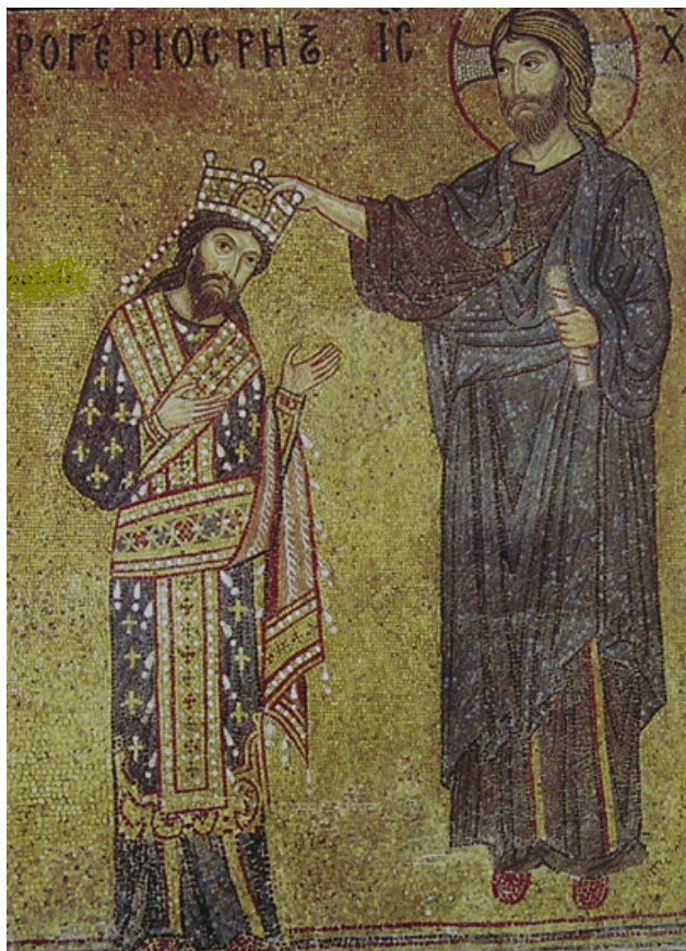
Fig. 2. Christ crowns Roger II , Church of Santa Maria dell' Ammiraglio, Palermo.