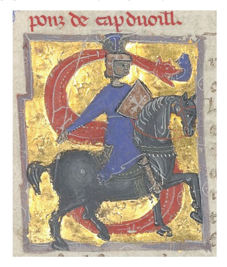
Fig. 7. Troubadour Pons de Chapteuil. Chansonnier. Paris, Bibliothèque national de France MS fr. 12473, ca . 1275. Folio 5.

Two of these werewolf legends, however have neither antique source nor exotic location like Scythia, but seem purely examples of local folklore. The first, which does in fact come from Gervaise, (Bersuire says "ponit Gervasius"),<sup>44</sup> is the story of an historical person, Pons de Chapteuil (1160-1220), of Chapteuil in the Auvergnat diocese of Clermont, a troubadour (Fig. 7) (shown here in a Provençal chansonnier as a crusader) important for the development of the Auvergnat dialect as a literary language.<sup>45</sup> He was not so distant from Bersuire's lifetime, and would be of cultural interest for both Gervaise and Bersuire. He supposedly disinherited a knight, Rambault de Pulet, who went mad as a result, and roamed the mountains of the Auvergne attacking people. A woodsman cutting off his paw brought him back to human state.