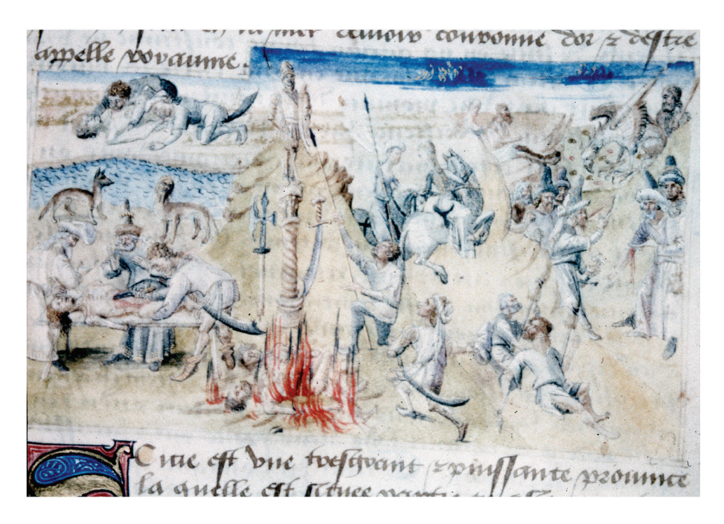
Fig. 6. Scythia. Werewolves. Master of the Geneva Boccaccio. Chapter 47, The Secrets of Natural History , MS formerly in the possession of Jean de Charnacé, Paris. ca. 1450. Folio 62.

The Scythian example (Fig. 6) shows how one artist illustrated the idea of werewolf transformation in that land, showing among other wonders of the region at upper left two men eating another, and below a human-headed wolf. Some of these werewolves are full time and some part time, where the naturalistic explanation of temporary werewolves assumes their condition results from some tremendous mental shock such as loss of loved ones or economic disaster.<sup>43</sup>