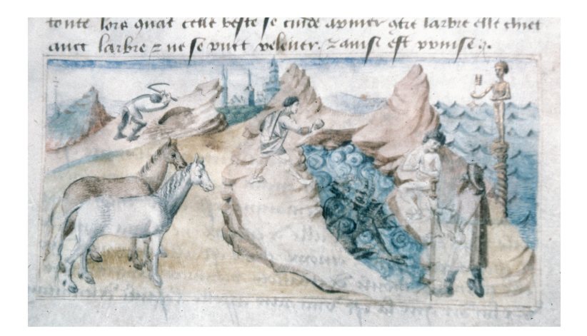
Fig. 1. Wonders of Spain. Master of the Geneva Boccaccio. Chapter 24, The Secrets of Natural History , MS formerly in the possession of Jean de Charnacé, Paris. ca. 1450. Folio 32v.

Each chapter of the SNH, accompanied by an illustration crowding into a single visual field many or all of the wonders mentioned in the text, gives memorable information on crops, marital and courtship customs, religious and burial practices, forms of habitation, and commercial practices of a region or country. I call this visual arrangement a menu picture since the miniature is a sort of menu for what the user will find in the chapter. Key among these features of the individual land or region, Iceland, Spain, Pygmy, Provence, Amazonia and the like, are the unusual races of men and bodies of water, monuments, cemeteries, mines, fata morgana-like parallel landscapes, plants, animals, birds, fish, and insects to be found there (Fig. 1). For example, in this illustration for Spain, the story of mares that conceive from the wind blown over stallions is given a prominent place through size and placement of the two mares. Other wonders are the marvelous and ever renewing mountain of salt near Cardona, shown being dug up by a man with a pick; a body of water with devils in the bottom, by which Peter of the Table mourns for his lost child, held captive by the lake-devils; and a bronze Muslim idol on a pedestal allegedly erected in Al-Andalus or Moorish Spain.