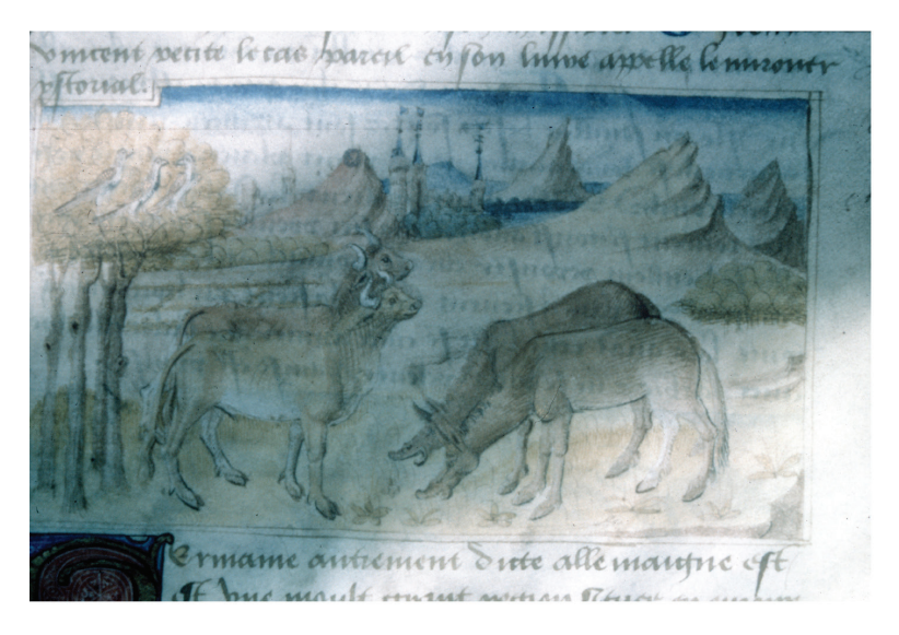
Fig. 2. Germany. Master of the Geneva Boccaccio. Chapter 23. Remarkable cattle. The Secrets of Natural History , MS formerly in the possession of Jean de Charnacé, Paris. ca. 1450. Folio 32.

In this region [Bohemia] there is a savage beast that is named, according to the language of the place, the "loz." And it is of such a condition and nature that it bears under the throat a great bladder like a sac. And when this beast is pursued and chased by hunters and dogs, it retreats into a river or a pond and drinks so much that it fills this sac completely with water, and then as it runs, it warms the water beyond boiling. Then this beast turns sharply to run directly towards the dogs and hunters, and it vomits and spews this very hot water in the sac from its throat and gullet onto the dogs and hunters that it finds in its way. And the dog and hunter who is struck by this water that is so hot is punished and harmed irremediably. And the result is that on the spot where this hot water has touched, the skin and the flesh will fall away permanently because it is so hot and poisonous. And by this means the wild beast retreats into the woods to wherever he pleases, free, calm, and delivered from the danger and peril of dogs and hunters. And by his special ability, knowledge, and natural condition, he makes all flee and disappear before him. And because of this, it seems to me that this wild animal has greater freedom and greater ability for the defense of its body than has any other wild beast.30