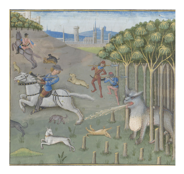
Fig. 5. Loz. Bohemia. Robinet Testard. Chapter 8, The Secrets of Natural History . Paris, Bibliothèque national de France MS fr. 22971, ca .1480. Folio 9.