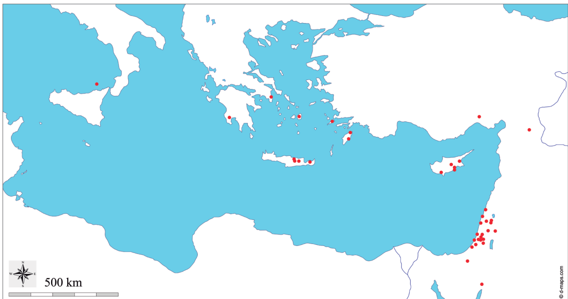
Figure 1 – Distribution of phytomorphic carnelian pendants in the Eastern and Central Mediterranean (excluding Egypt). Cartographic base: d-maps.com.

Within Egyptological literature, recent works seem however to favour the identification of these pendants as representations of cornflowers ( Centaurea depressa ), which had already been suggested by C. Müller-Winkler (1987: 277-80). This is an exotic plant, indigenous to the Levant but not to Egypt, where it seems to have been introduced as an ornamental garden flower during the early 18 th Dynasty (Hepper 1990: 14). In recent years, J. Phillips, among others, has retained the identification of these pieces as “cornflower beads” (Phillips 2003; 2008: 140-5).