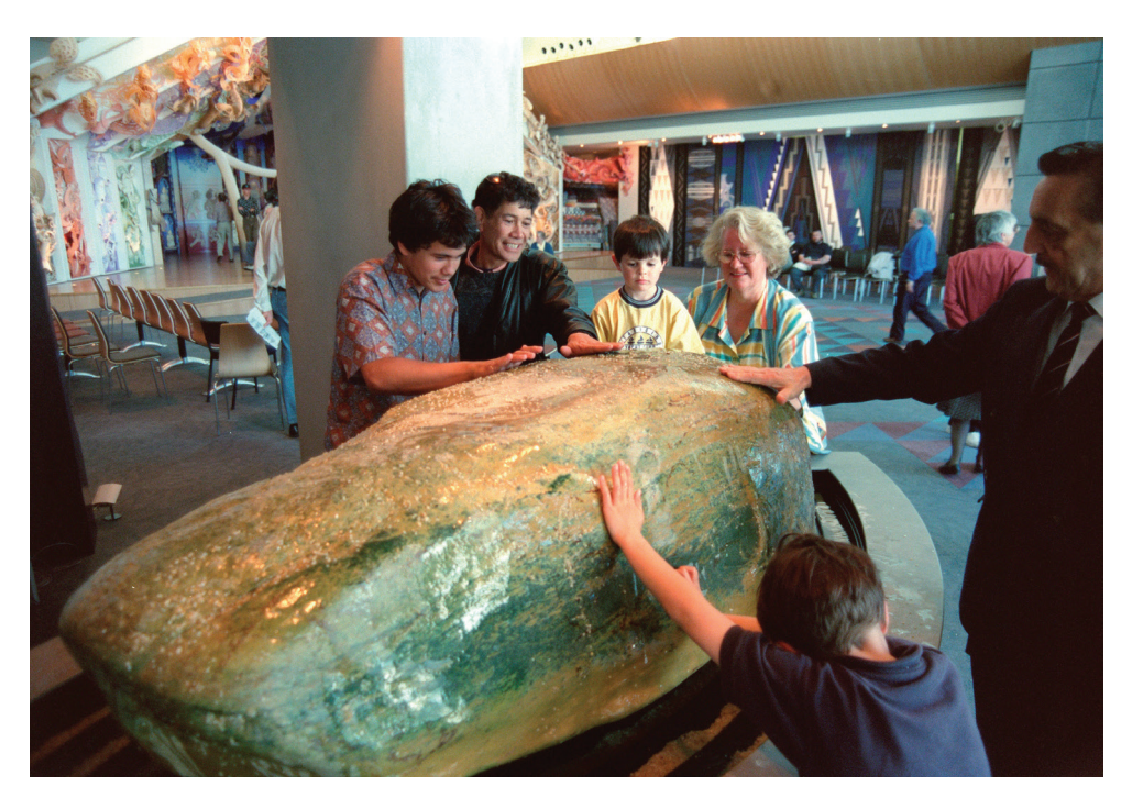
Fig. 1. Visitors to Te Papa rub the pounamu.

can be called nephrite or New Zealand jade. In the theme of Māori culture, the fact that it is a gift from the Kāi Tahu tribe is also highly significant in curatorial terms. Using Māori language to describe the pounamu, the museum reflects on the generous gift that was made in 1986. Curatorial texts tell visitors that pounamu was and is used to fashion tools, jewellery and weapons. Pounamu is highly prized by the Māori and has a rich symbolic value; it symbolizes firm foundations in relationships. Pounamu is loved for its toughness and great beauty and is used in gift giving, often when a relationship needs to be repaired. It has a spirit or wairua which protects Māori values.