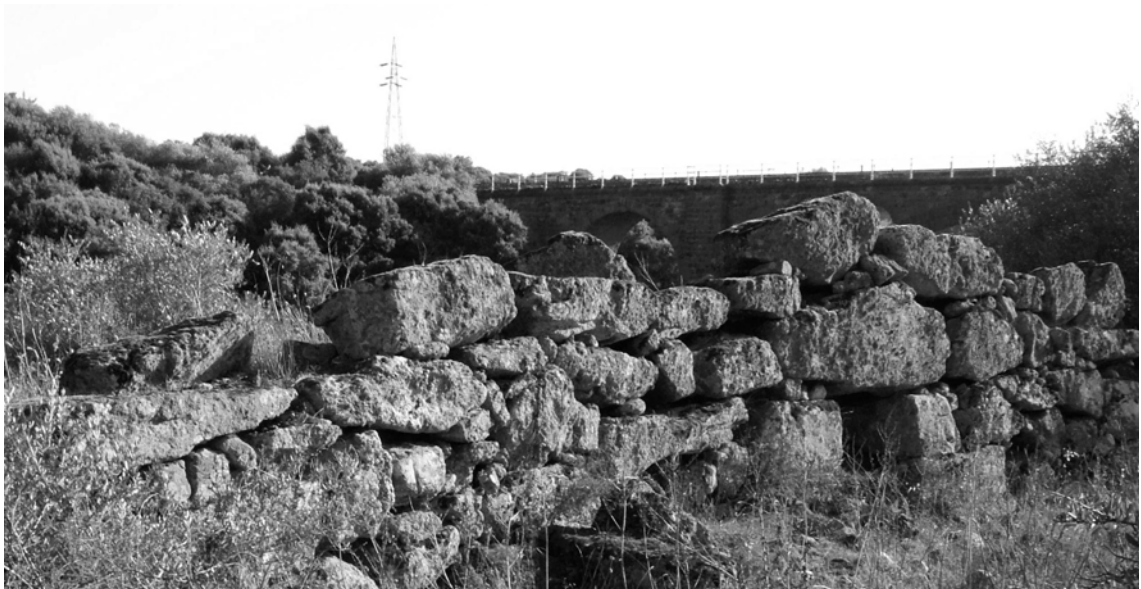
Figure 7.- The Coghinas building.

The fact that the sacred area is extremely close to the wall thus leads to think that the two actually form part of the same architectural unity; actually, the wall forms an artificial curtain for the west side of the sacred area. The summit of the wall is clearly too low to permit a secure defence; in turn it was easily accessed from the inside via a stone staircase and allowed for a perfect view of what could even-