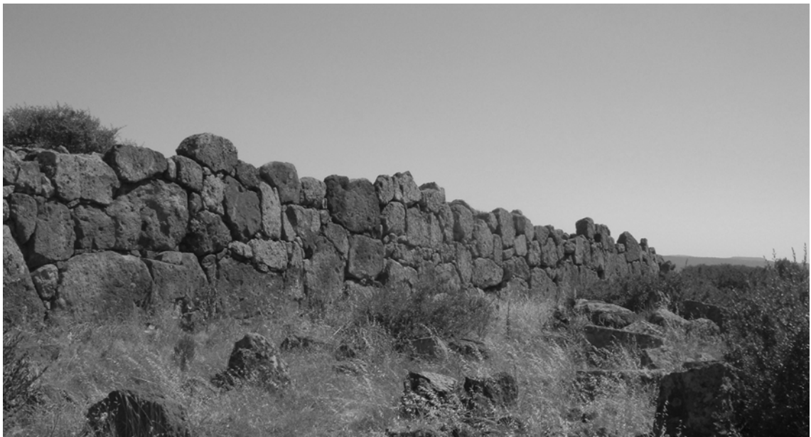
Figure 3.- The megalithic wall.