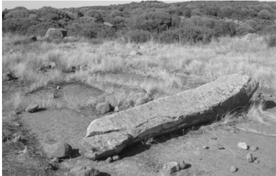
Figure 4.- The menhir ready to be put in place from 4400 years, with the profile of the socket carved in the bedrock.

even say that it was abandoned precisely the day in which this monolith was to be erected , since the huge stone lies at the final point of its journey from the quarry. Indeed, on the ground just below the base, the contour of the socket was carved in the bedrock. The stonemason sketched the profile of the socket and what was missing was only the excavation of the pit inside which the stone was to be fixed (Figure 4).