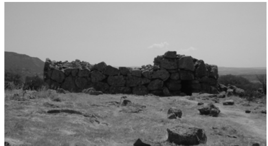
Figure 2.- The tower-enclosure viewed from the approach to the Monte Baranta hill.

The megalithic wall divides the summit of the plateau into two parts. The “internal” part houses a small village of six stone-founded dwellings which might have been inhabited at most by a few tens of people (the total surface of the walled area is about 2700 square meters). No springs or water wells can be recognized here. The external part of the hill’s summit is usually defined as a “sacred area” composed by a circle of stone slabs (today not standing any more) lying on an artificially levelled bedrock, and by two menhirs. The tallest of the two was quarried and brought to the site, but never erected; the building site appears indeed to have been suddenly abandoned. Stretching things a bit we could