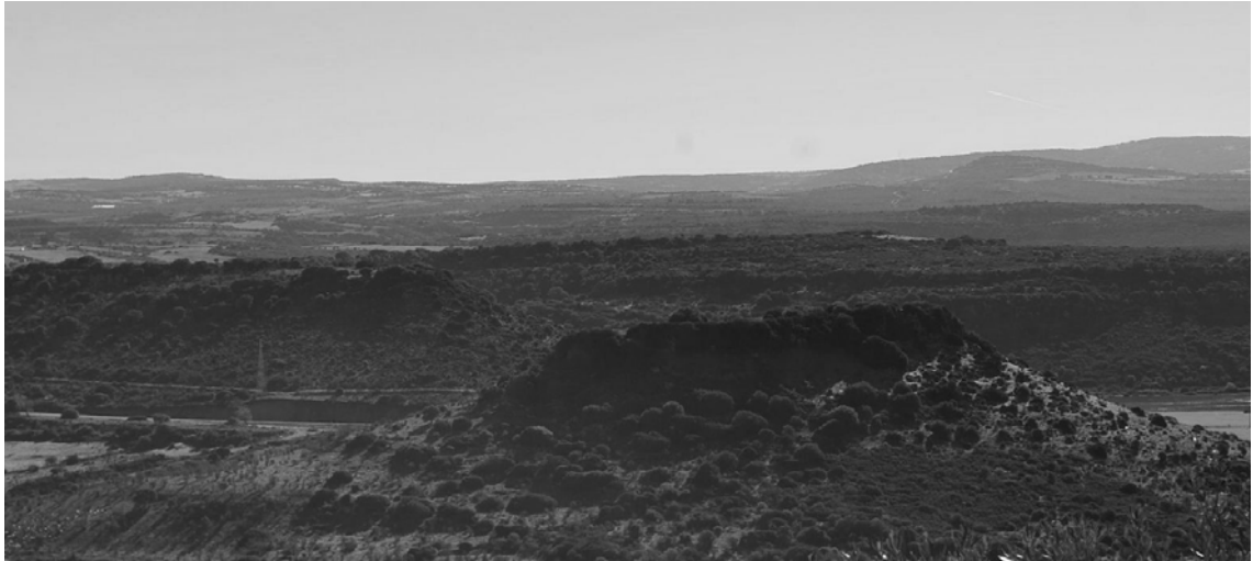
Figure 5.- The S. Pedru hill viewed from the inside of the tower-enclosure.

The hill lies about 1 km to the south-east of Monte Baranta and forms a sort of scenery foreground for the horizon in that direction (Figure 5). The visibility of this hill from the summit of Monte Baranta is constrained by the ancient buildings in a very peculiar way; indeed, the hill turns out to be invisible for any people standing outside the megalithic wall or the tower, the view being impeded by the wall; an imposing view is instead allowed from the inside. In a sense, the tower-enclosure looks as a sort of belvedere open towards the hills to the south-east.