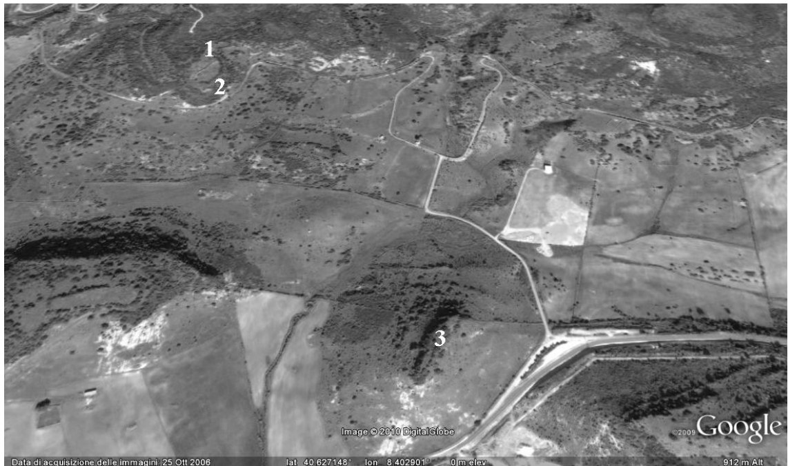
Figure 9.- The visual relationship between the “village” at Monte Baranta (1), the “Tower-enclosure” (2) and the S. Pedru hill (3) (Image courtesy of Google Earth).