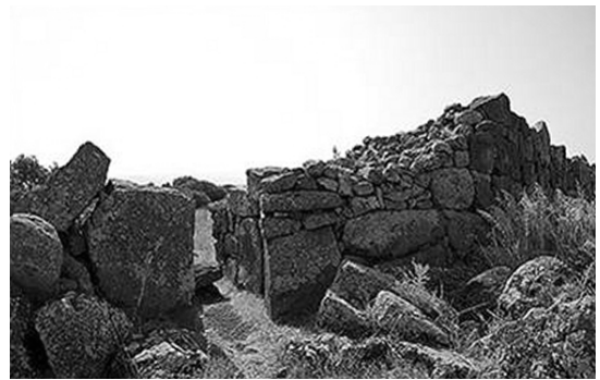
Figure 6.- The entrance to the megalithic wall.

Any visitor entering the tower-enclosure for the first time remains simply astonished. Indeed, the thickness of the wall varies from a minimum of 3 meters to a maximum of 6 meters; this means that the area occupied by the wall is greater than the very small area enclosed by the wall itself! Even