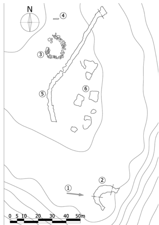
Figure 1.- Map of the Monte Baranta complex. 1) Direction of the ascending path from the west 2) Tower-enclosure 3) Stone ellipse 4) Recumbent menhir 5) Megalithic wall 6) Dwellings.

The Monte Baranta complex is located on the southern flanks of the homonym plateau, a top-flat hill that runs roughly in a north-south direction between Monte Rosso and Monte Miale Ispina. It has a steep east flank and a rather smooth west flank. The complex can be accessed today from the west via a modern hike, partially carved in the rock, which very probably reaches the summit on the same path of one of the ancient access ways (see map in Figure 1). On reaching the summit, the visitor is stricken by the view of a huge megalithic building (usually called “tower-enclosure”) composed by a double-curtain megalithic wall with two entrances. One of the entrances fronts the hike to the west; while the other runs north-south (precise azimuths will be given below). The wall delimits an area which directly overlooks the gorge on the east flank of the hill (Figure 2). On the internal side of the wall a sort of balcony, accessible