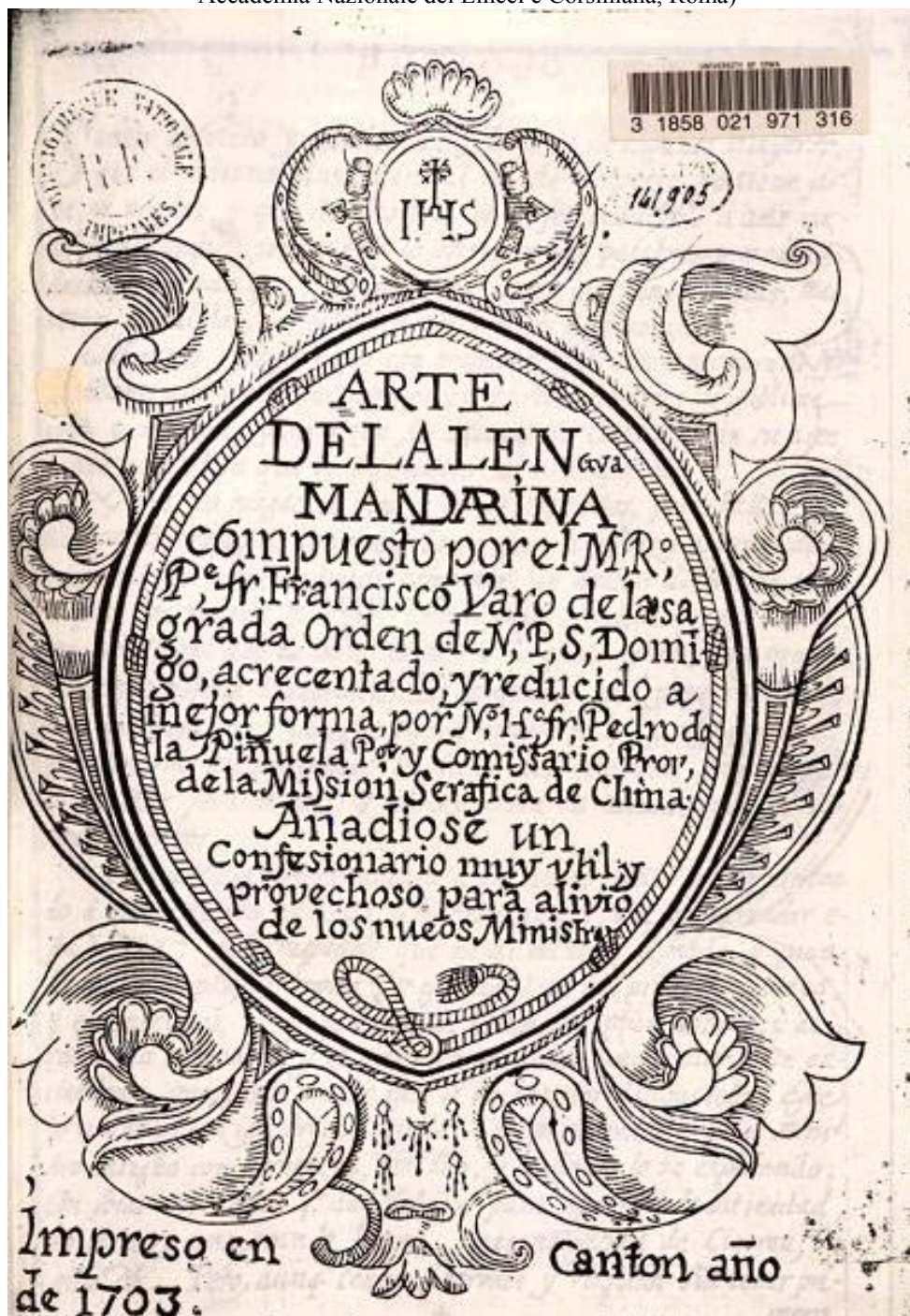
Figure 1. Cover of the Arte de la lengua Mandarin (Original from the Library of the Accademia Nazionale dei Lincei e Corsiniana, Roma)