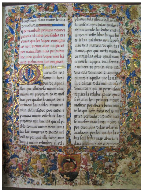
Fig. 2. Manuscript of the Virtuosas e claras mugeres by Álvaro de Luna. Salamanca, Biblioteca de la Universidad de Salamanca, Ms 207, fol. 3r.