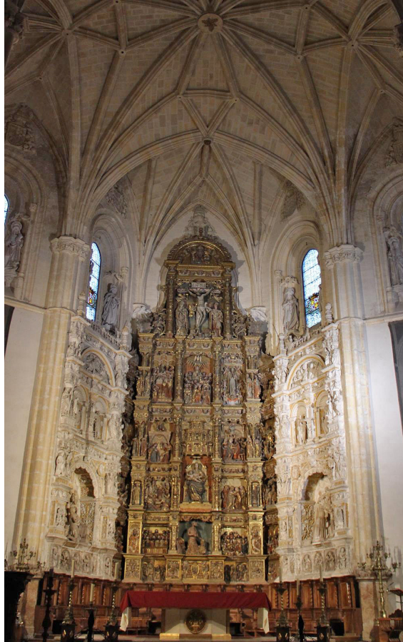
Fig. 5. Funerary monuments of Juan Pacheco and María Portocarrero in the main chapel of the Monastery of El Parral.