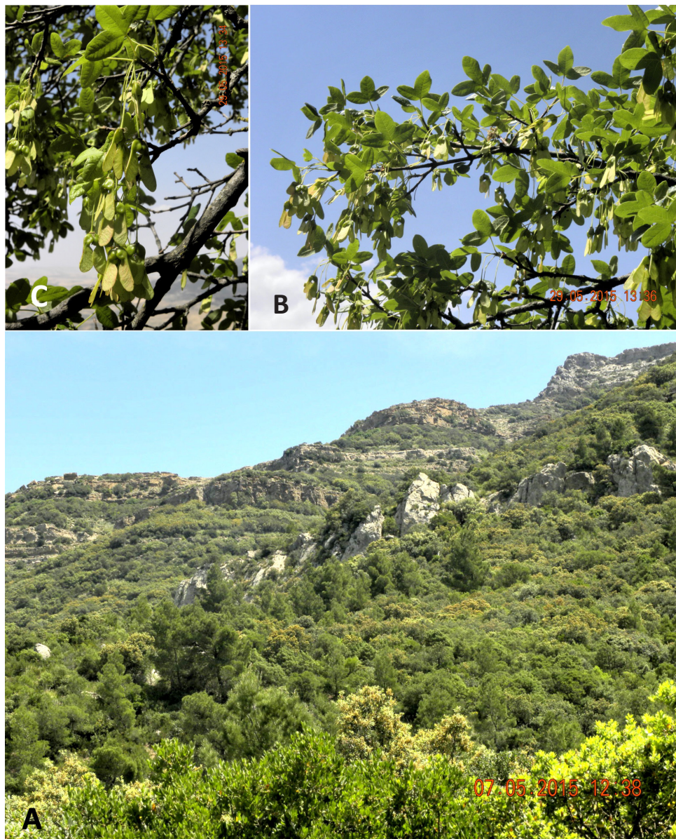
Figure 1. Acer monspessulanum subsp. monspessulanum in northwestern Tunisia. A: habit of the main population in Siliana mountains. B: leafy branches with typical thin, green, entire 3-lobed leaves in fruiting period. C: typical disámara with wings less constricted at the base slightly divergent towards the top.  in Siliana region (NW of Tunisia), 07 and 29 May 2015.