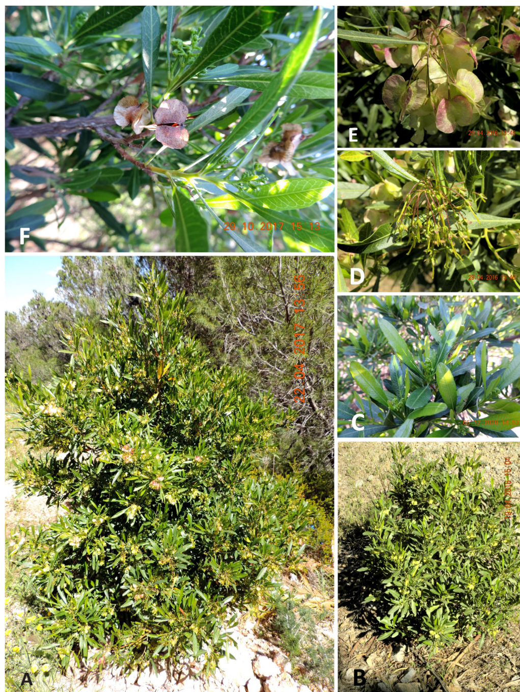
Figure 5. Dodonaea viscosa in northeastern Tunisia. A-B: plant habit in two different habitats. C: beginning of blooming. D: inflorescence and flowers. E: globose 3-winged fresh fruits. F: dried dehiscent capsules. in Zaghouan region (NE of Tunisia), 10 April 2016 to 05 December 2020.

compressed-globose, 2- or 3-winged, 1.5–2.2 cm tall, with wing 1.8–2.5 cm wide; testa membranous or papery, veined; seeds 1–2 per locule, black, lens-like (cf. WFO 2023a).