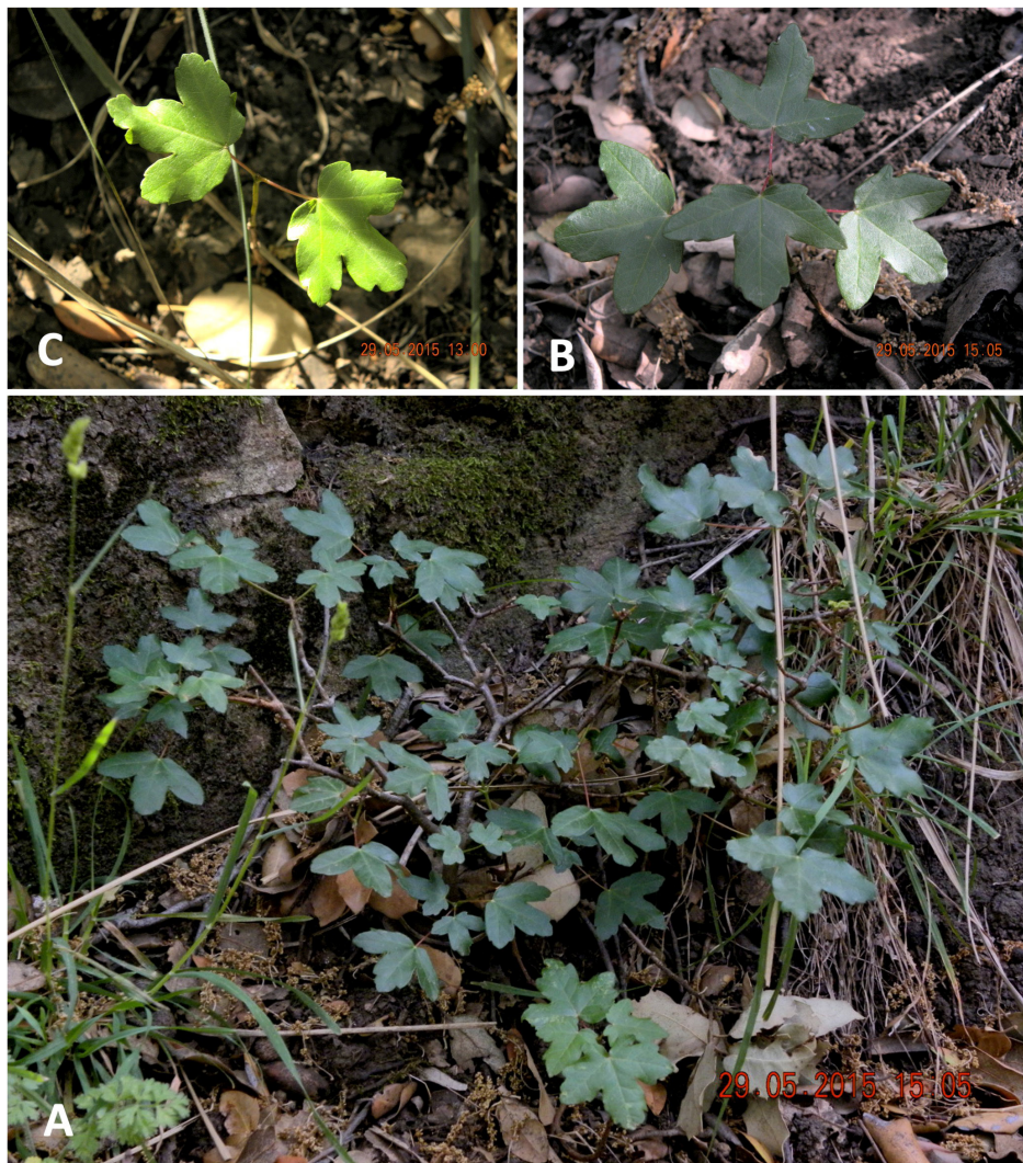
Figure 3. Acer monspessulanum subsp. martinii in northwestern Tunisia. A: plant habit in its habitat. B: details of typical leaves, adaxial face. C: germination of one-seeded samara. in Siliana region (NW of Tunisia), 29 May 2015.

Phenology. Flowering time March to April; fruiting time May to June.