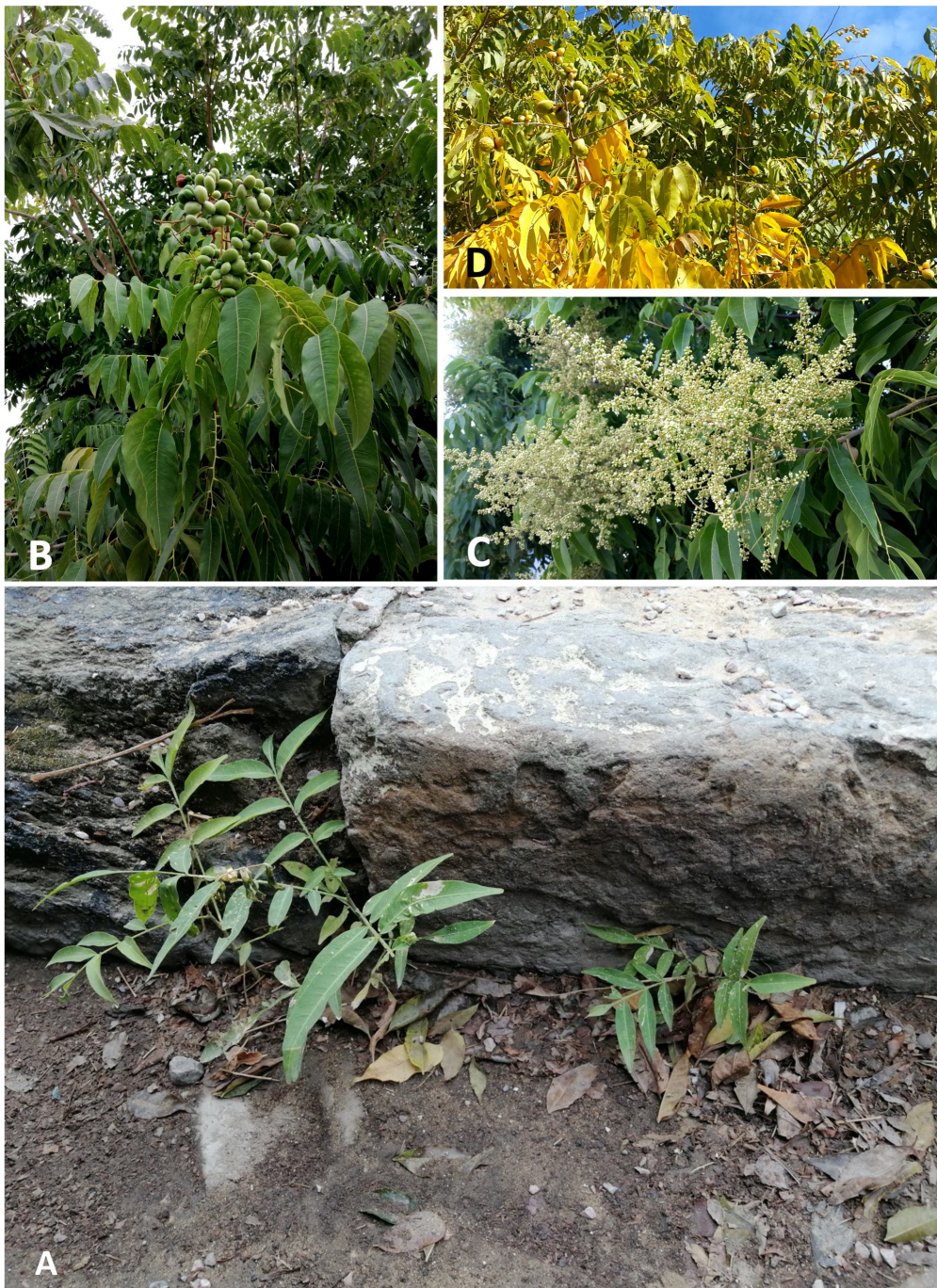
Figure 6. Sapindus saponaria in northeastern Tunisia. A: Juvenile plants from seeds. B: plant habit during fruiting period. C: inflorescence and flowers. D: mature fruits. in Bizerta region (NE of Tunisia), 21 December 2015 to 14 September 2020.

Myanmar, Philippines), as well as in the Galápagos archipelago (POWO 2023). On the contrary, it is rare in Europe, where it is recorded only from Cyprus but as a cultivated plant (Raab-Straube 2018+; POWO 2023).