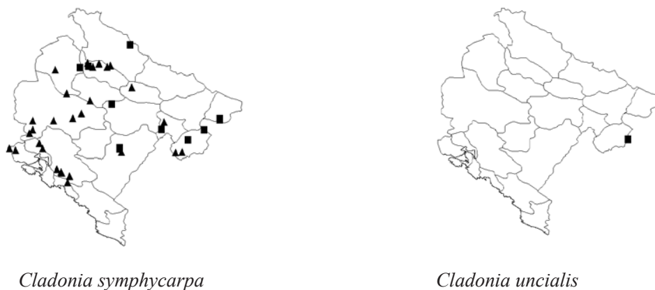
Figure 3. Distribution of Cladonia species in Montenegro. Bibliographic reports: ■, new records: ▲.

Seven species are chemically variable (Table 1), C. cariosa with 4 chemotypes, C. furcata with 3, C. macilentata with 2, C. macroceras with 2, C. rangiformis with 2, C. rei with 2 and C. symphycarpa with 5. A complex combination of chemotypes was found in the so-called C. cariosa group. Most of the specimens of C. cariosa have podetia but not C. symphycarpa , which difficulties the adequate morphological identification. Similar chemical variability was published of Poland (Osyczka & Skubala 2011) and Albania (Burgaz et al. 2019). Pino-Bodas et al. (2012a) confirmed that morphological or chemical characters were insufficient to delimit the species boundaries in the group and considered the existence of four phylogenetic lineages. At present, a molecular study on this group is underway including specimens from other European and American countries, but we do not yet have definitive results (Pino-Bodas et al. in prep).