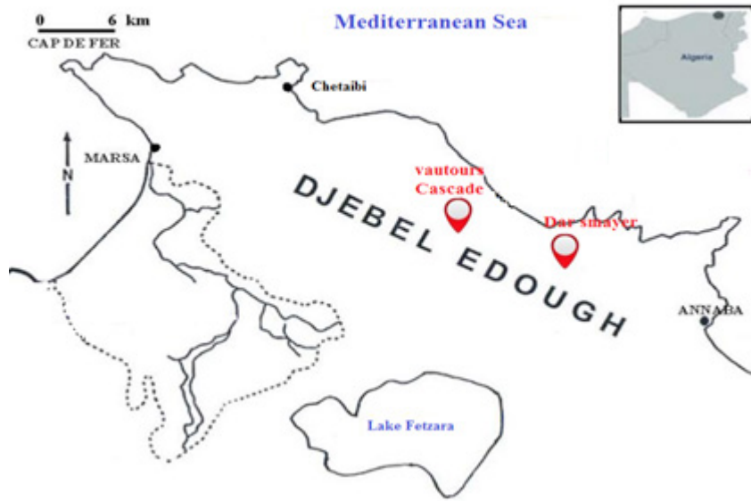
Figure 1. Location of stations studied in Edough Peninsula (north-eastern coast of Algeria).