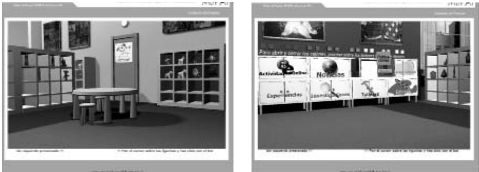
Figuras 2 y 3. Distintas perspectivas del MUPAI Virtual 3D.

Navigation within the space of the museum is “free,” although we restrict the movements of visualizations or positions that are not the normal ones when visiting a museum. For example, one cannot turn the camera upside down. However, it does allow one to freely wander around any part of the facilities.