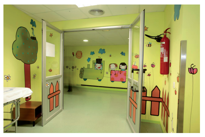
Fig. 4. Ilustrations used to decorate the area of pediatric emergencies (Artist Paula Núñez).