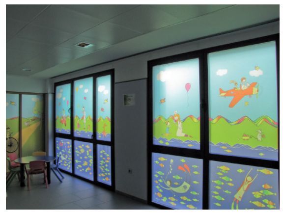
Fig. 5. Waiting-room illustrations of a pediatric consulting office (Artist Clara Hernández).

Art, as a vehicle of social meanings and as a means to express emotional experiences associated with health and disease, becomes a protagonist in the health sphere (Camic, 2008; Stuckey & Nobel, 2010). The assessment of the impact of the art programs in the health setting is the subject of discussion. The incorporation of art programs in health settings requires the development of assessment tools than can provide evidence to support the continuity of these intervention models, showing us what, when, and how to introduce diverse art forms to achieve the most effective results (Staricoff, 2006). The problem is what should be understood as evidence within this context (Putland, 2008). But, besides the advances in the assessment methodology, the development of these programs requires the use of shared languages and multidisciplinary vocabularies that reflect interests and values that are inherent both to the perspective of health and to that of art (Putland, 2008). To conceive of art as a "symbolic environmental mediator" in health care settings allows to do this and, in the pediatric health settings, it has fostered the development of artistic interventions as a resource to improve the quality of children's health care settings.