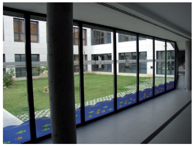
Fig. 3. Ilustrations used as signposts in a pediatric consulting office (Artist Clara Hernández).

tration used responded to the requirements of the space where the intervention took place (luminosity, location, etc.) and the aspects that, from the psychological viewpoint, should be emphasized in order to have a positive impact on the pediatric patients' emotional status (mood, play, distraction, etc.). The illustrations were conceived to affect children's' mood positively, avoiding fearful situations within the medical care settings and enhancing the children's distraction and play. This type of illustration can be considered a "symbolic environmental mediator" that has been shown to have an important capacity to make health settings more suitable for children. Sign-post panels to indicate directions and locations in the health facilities.