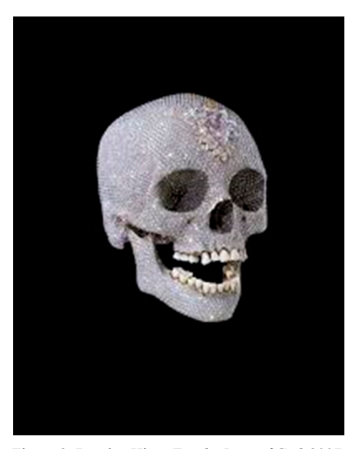
Figure 3. Damien Hirst, For the Love of God , 2007. Disponible en: http://www.damienhirst.com/for-the-love-of-god.

Hirst combined the imagery of classic vanitas and memento mori with inspiration drawn from Aztec skulls. The process of idealization and aesthetification is quite evident. Even though the skull is authentic what is extraordinarily curious is that the brilliance of the diamonds can turn this vain and dark matter into a true object of desire. As the artist argues, "You don't like it, so you disguise it or you decorate it to make it look like something bearable – to such an extent that it becomes something else" (Hirst cited in Burn: 2008, p. 21).