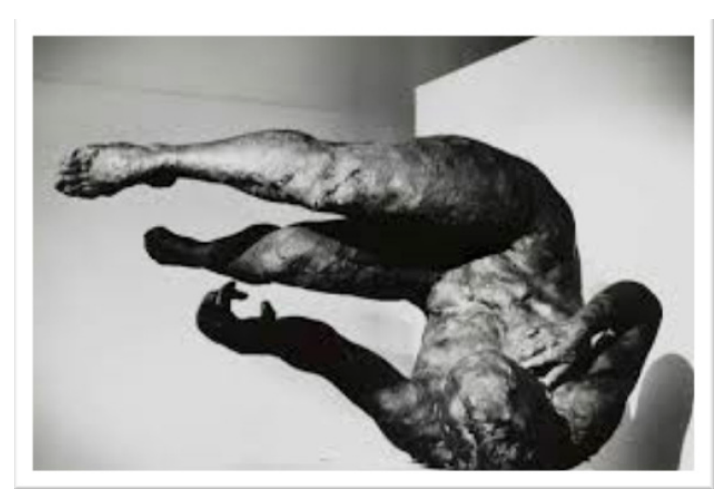
Figure 2. Eric Fischl, Tumbling Woman , 2002. Disponible en: http://www.ericfischl.com/html/en/sculpture/2001 042.html

The depiction of a beautiful death is pleasant even when it refers to a photograph of a real corpse and not to a mere representation of it, especially if it evokes a sort of romanticism or eroticism, but if the artistic representation convenes to recent and traumatic memories as was the 9/11 in New York city, a sculpture like the Eric Fischl's Tumbling Woman may be publicly censured and considered offensive. (Fig. 2)