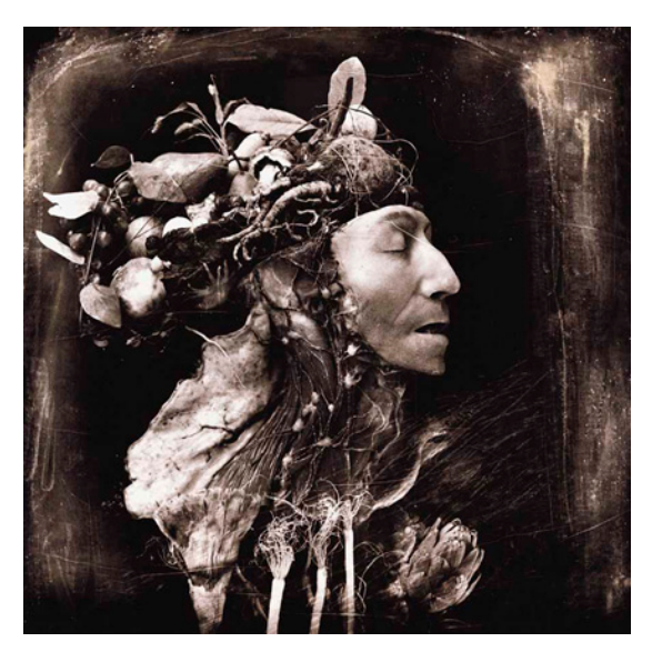
Figure 5. Joel- Peter Witkin, Harvest , 1984 Disponible en: http://www.orderofthegooddeath.com/after-joel-peter-witkin#.VsM7LLSLTMw

Witkin considers issues of morality as central to his work. Starting from a large frame of sources - literature, myth, and Renaissance and Baroque painting - Witkin creates in an ingenious way photographic tableaux that recall us to the macabre, to the mystic, to the erotic, and to the religious. We can foresee moral issues represented from the most bizarre images of human frailty with abundant art historical references, manipulated negatives and prints, Baroque staging and lighting. The artist also frequently uses dead bodies or body parts, that he deliberately handles in the creation of his work. (Fig. 5) Witkin's most emblematic photos portraying corpses and body parts were performed in Mexico (where else could this artist get away with such a task legally?) using corpses from a hospital in Mexico City that let him sort through unclaimed, anonymous corpses and body parts picked up on the streets to use in his artworks