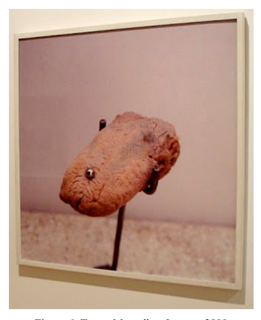
Figure 6. Teresa Margolles, Lengua , 2000

Just like relics, her art works become sacred and the victims, once anonymous and forgotten by society, reach a kind of holiness and sacred aura . The use of the corpse, with forensic inspiration, is far from the hygienically and scientific intention of an artist like Gunther von Hagens. There is a nobility in death, but death is cursed, one can not show it without the justification of religion, a place that Margolles seems to claim for the artistic territory. Her works, with clear metonymic and symbolic intention, makes use of fragments of corpses or objects that were in contact with the bodies, summoning the spirit of the holy relic to a yore violent and bloody scene. (Fig. 6)