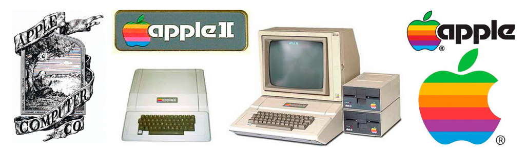
Figure 3. Original seal of Apple (1976) and logo-symbol of Apple II (1977).

The logo-symbol of La Caixa emerged as an accumulation of symbolic metaphors referring to contrasting and implicitly combined concepts. The symbol part of this logo-symbol is taken from a tapestry by Spanish artist Joan Miró and expresses his typical artistic style and that of the Mediterranean culture of the company. This visual part contrasts with the typographic part since it transmits opposing values. The irregular form and polychromatism typical of Miró's art is combined with the stability and sobriety of the typography in order to add the serious nature of banking to Mediterranean values.