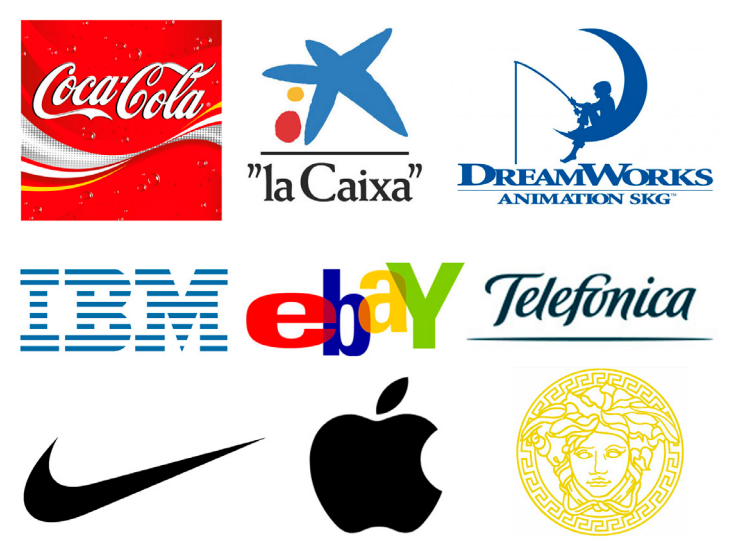
Figure 1. Sample analyzed.

The sample is thus comprised of the logo-symbols of Coca-Cola, La Caixa, and DreamWorks, the logotypes of IBM, eBay, and Telefónica, and the symbols of Nike, Apple and Versace.