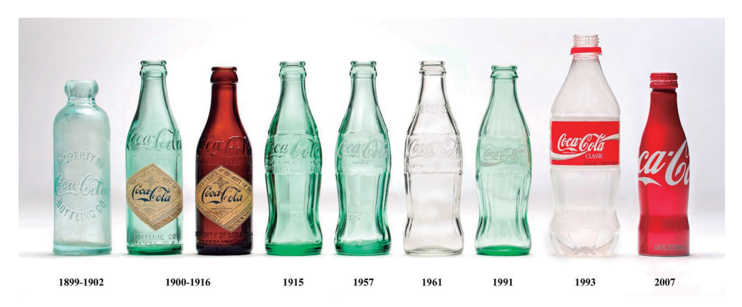
Figure 6. "Hypertextual" evolution of the contour bottle.

Understood in this way, the memoria of a logo-symbol manifests the trajectory of the visual expression of a specific brand from the time it comes into existence, moreover determining its particular contribution to a general corporate visual culture which it helps to create and enrich.