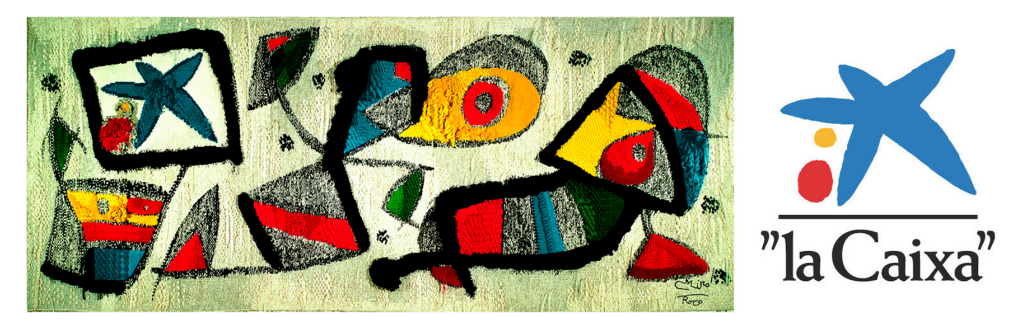
Figure 4. The Miró tapestry from which the logo-symbol of La Caixa was taken.

The logo-symbol of La Caixa emerged as an accumulation of symbolic metaphors referring to contrasting and implicitly combined concepts. The symbol part of this logo-symbol is taken from a tapestry by Spanish artist Joan Miró and expresses his typical artistic style and that of the Mediterranean culture of the company. This visual part contrasts with the typographic part since it transmits opposing values. The irregular form and polychromatism typical of Miró's art is combined with the stability and sobriety of the typography in order to add the serious nature of banking to Mediterranean values.