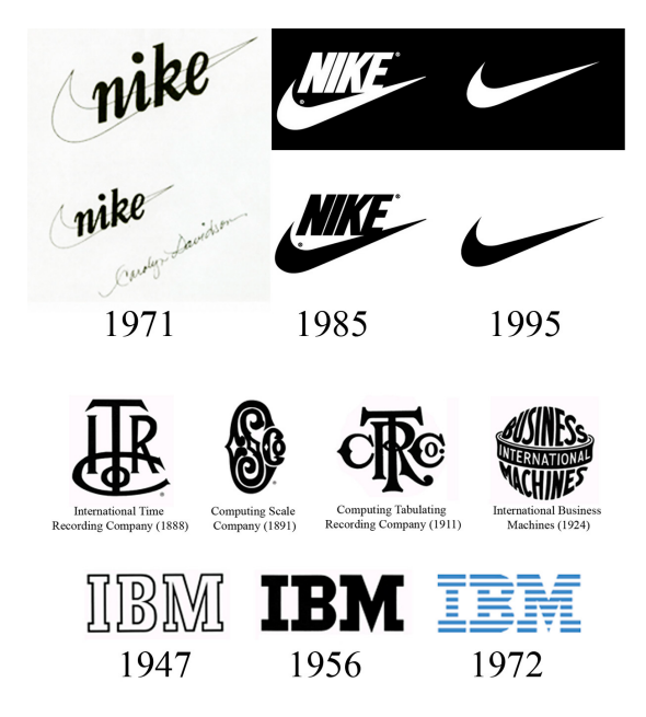
Figure 5. "Hypertextual" evolution of the Nike logo and "Hypertextual" evolution of the IBM logo.

- Transformation . In this case, the "hypertextuality" is generated by the historical evolution of the logo-symbol, which gradually changes its expressive style, either to accommodate a new commercial context or to adhere to new corporate values, but maintaining a basically stable content. Thus, the first logo used by the company becomes the original "hypotext," the point of reference for the rest that emerged later and which generally become its "hypertexts." Two examples we can cite are the logos of Nike and IBM (Fig. 5), the expressive evolution being most evident in the latter case.