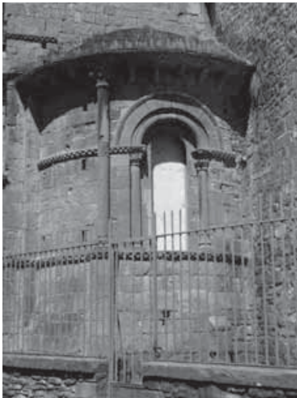
Fig. 1. South apse, Jaca cathedral.

Thus, the cathedral of Jaca is probably the product of a much slower development than it would at first appear, since its most prominent constructive features are those that reject the traditional manner of building in Altoaragón, that is precisely those features that must have characterized the cathedral’s original building program, which Esteban describes. The point can best be illustrated by comparing Jaca cathedral (fig. 1) with the Torre de la Reina within the castle confines of Loarre (fig. 2), of about 1020 or 1030, or with the church of San Caprasio in Santa Cruz de la Serós (fig. 3), of about the same date, 19 buildings in the so-called First Romanesque or Lombard style. Evident is the change from the irregular masonry ( sillarejo ) of the early buildings to the evenly cut and finely laid ashlar masonry ( sillería ) of the cathedral. Apparent as well at Jaca and absent in the early works of the region are decorative features such as billet moldings, which articulate and separate