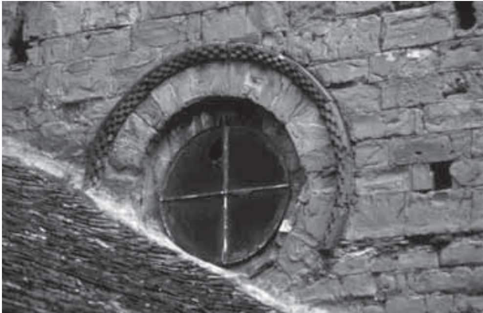
Fig. 19. Jaca cathedral, bull-eye window.

It is, in truth, hard to imagine what contemporary viewers might have thought of the large and noble stone building covered with a timber roof. But, then again, this architectural form was not the only unusual feature of the cathedral. The tympanum, so beautifully composed and elegantly placed, was, as I have mentioned, certainly among the first tympana in Europe. And, the meaning and placement of the Jaca tympanum, as I and others have tried to demonstrate, seem certainly to have been tied to the identity (or self-identity) of the newly established Aragonese king and kingdom, bishop and bishopric. Thus, it would not be surprising to find that similar concerns to those expressed on the tympanum might well have affected the choice of the architectural forms employed for the design of the building, including its wooden roof.