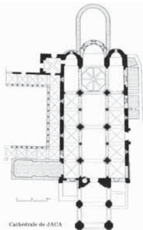
Fig. 5. Plan, Jaca cathedral. A. CANELLAS LÓPEZ and A. SAN VICENTE, Aragon roman , La Pierre-qui-Vire, 1971, p. 154.

Moreover, a number of Aragonese churches that in one way or another used Jaca as their model, to be sure much more modest in scale than the cathedral, seem never to have been vaulted nor to have been planned for vaulting: for example, Santa María de Iguacel (fig. 7), San Adrián de Sasabe (fig. 8), and San Salvador de Javierrelatre (figs. 9 and 10). Interestingly, these buildings had as