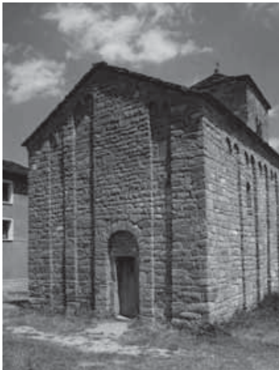
Fig. 3. San Caprasio, Santa Cruz de la Serós.

The Jaca cathedral that we see today (fig. 4) has suffered various renovations, transformations, and restorations to the Romanesque building that include the introduction of side chapels in the sixteenth century; 24 the rebuilding of the cloister, between 1615 and 1620, a project that lasted until 1693; 25 the destruction, reconstruction, and elongation of the main apse between 1790 and 1792; 26 and the addition of Renaissance vaulting to the nave