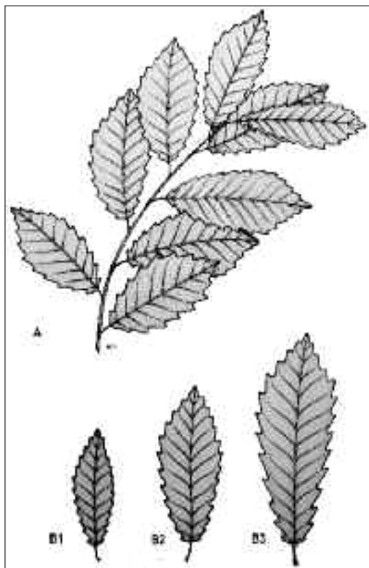
Figure 2. – Quercus xlousae C.Vila-Viçosa, F.M.Vázquez, Meireles & C.Pinto-Gomes. A: Branche fraction; B1, B2, B3: Leaves types morphologies.

Stirpem hybridam inter Q. broteroi et Q. marianica. Foliis breviter petiolatis (< 1,2 cm), basi cordatis, lamina breviter lobulatis, mucronatis, supra glaberimis, subtus pubescentis vel tomentosis, cum pilis solitaris, stellatis et multiradiatis.